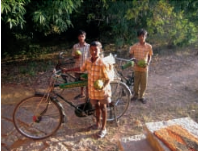
Boys selling papayas, Rishi Valley, India