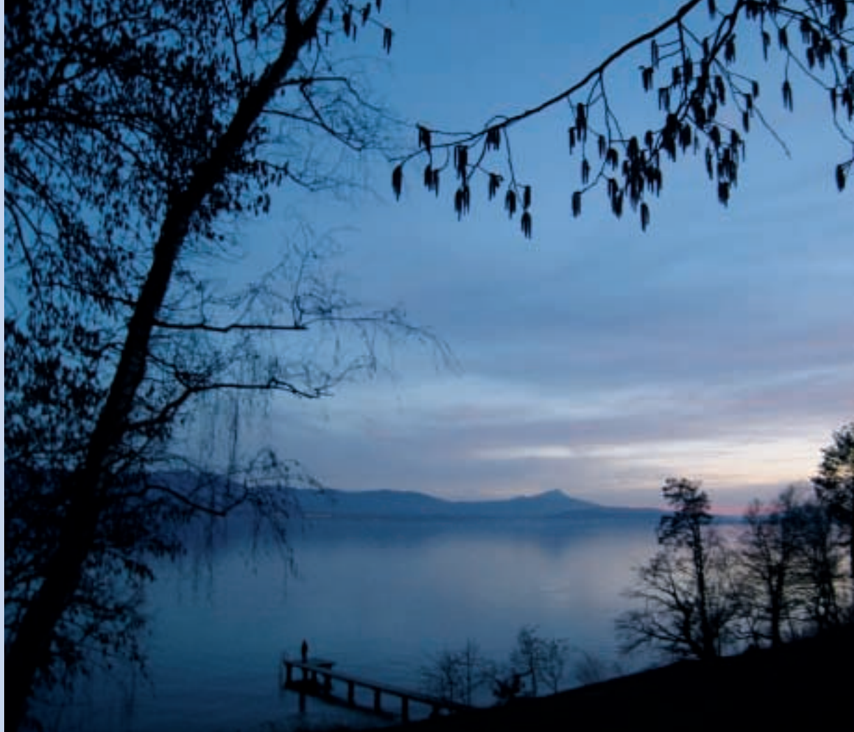
Lake Geneva at Buchillon, Switzerland

Therefore God or truth or what you will is a thing that comes into being from moment to moment, and it happens only in a state of freedom and spontaneity, not when the mind is disciplined according to a pattern. God is not a thing of the mind, it does not come through self-projection, it comes only when there is virtue, which is freedom. Virtue is facing the fact of what is and the facing of the fact is a state of bliss. Only when the mind is blissful, quiet, without any movement of its own, without the projection of thought, conscious or unconscious – only then does the eternal come into being.