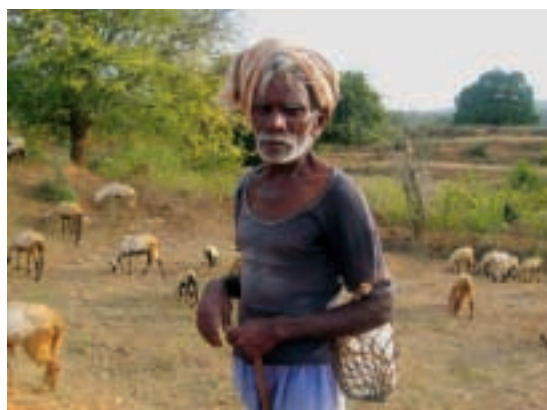
A shepherd near Thettu village, Rishi Valley, India

Brockwood Park School has a full complement of students (67) for the year beginning September '07, and in fact a waiting list of 14. This is good news. There is now a vital debate going on there concerning how to secure the School's future. One option is to provide more accommodation that