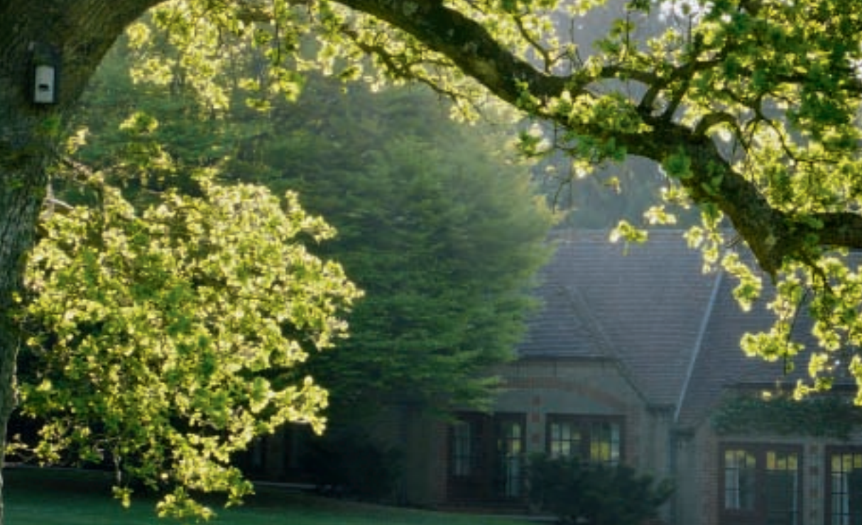
The Krishnamurti Centre, Brockwood Park, England

On the other hand, it would clearly be wrong to accept the notion that measure is inherently incapable of being anything else but a false and deceitful veil of illusion, covering the true nature of reality. Rather, one may perhaps say that whatever can be assimilated within the field of measure is real, but is of a dependent conditional sort of reality. What it depends on is ultimately the immeasurable totality. But this totality is not separate from the field of measure. Rather, the immeasurable overlaps and includes the measurable. Or to put it in another way, all that can be measured has its origin, its sustenance, and its ultimate dissolution in the immeasurable and indefinable which is the creative source of everything. Nevertheless, an adequate understanding of the measurable aspect of reality as a whole is evidently necessary for clear perception and right action in every phase of life.