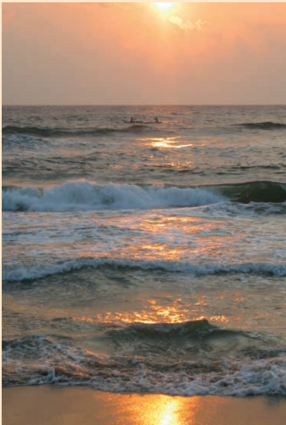
Adyar Beach at sunrise, Chennai, India