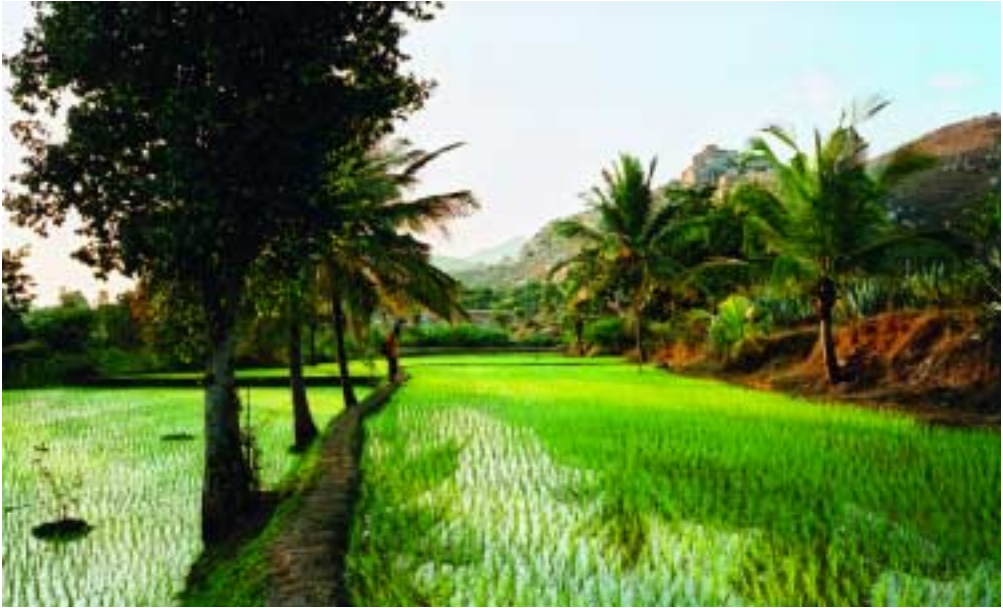
New rice fields near Rishi Valley, India