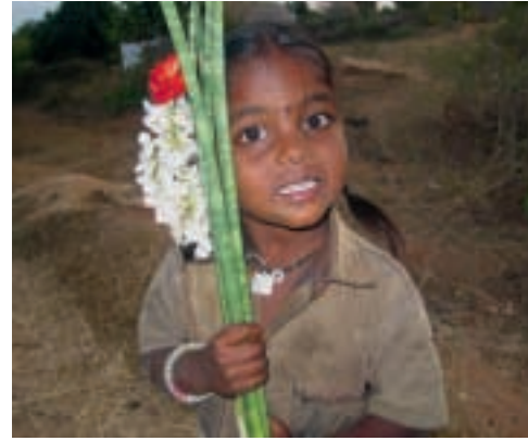
A little girl in the hills above Rishi Valley, India

Environmental education is also on the curriculum. Children become ecologically aware; they have a school garden where they learn to cultivate fruit and vegetables for their own use. Growing papayas provides a special boost for nutrition, and the importance of clean drinking water has become common knowledge. School is a place where children can play and where generations meet and grandmothers tell stories. School has become the heart of village culture.