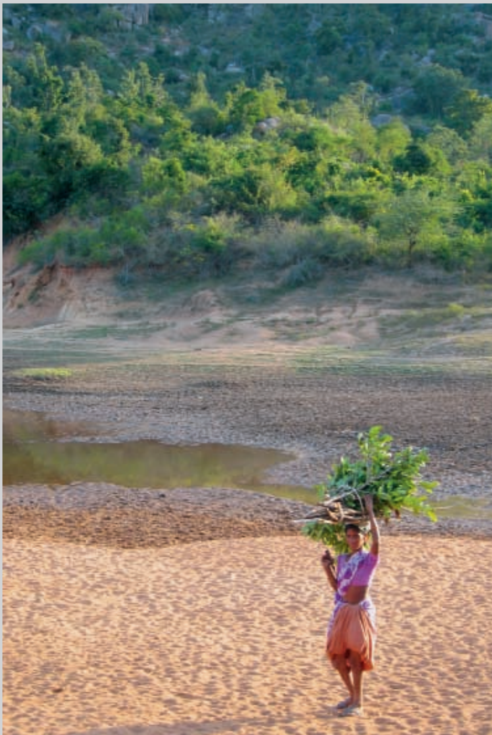
Collecting firewood near Krishnamurti Lake, Rishi Valley, India