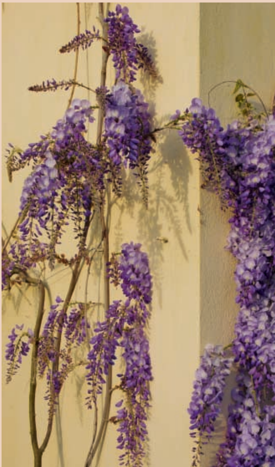
Wisteria at Brockwood Park, England