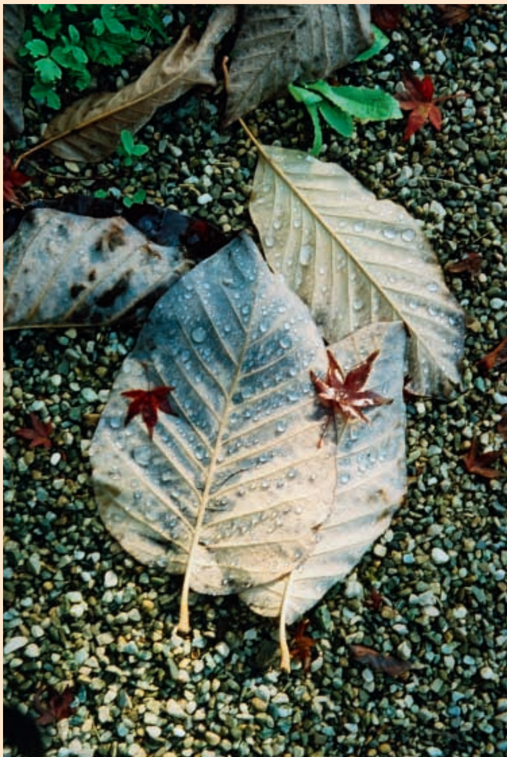
Autumn leaves, Buchillon, Switzerland