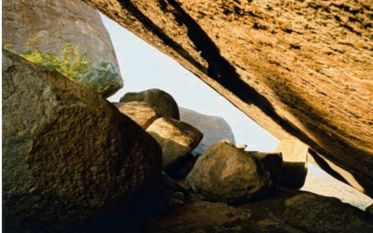
Climbing among the boulders of Windmill Rock, Rishi Valley, India

ily into its purview, turning the eye from the outer to the inner, from natural science to self-knowledge, and back again. This fluid movement from the inner to the outer and from the outer to the inner makes for the dissolution of this traditional division in the field of reality and undermines the separation between individual and society, as they are seen to be complementary aspects of a single process. In this way dialogue serves to dismantle the ingrained structure of fragmentation between man and nature and between man and man.