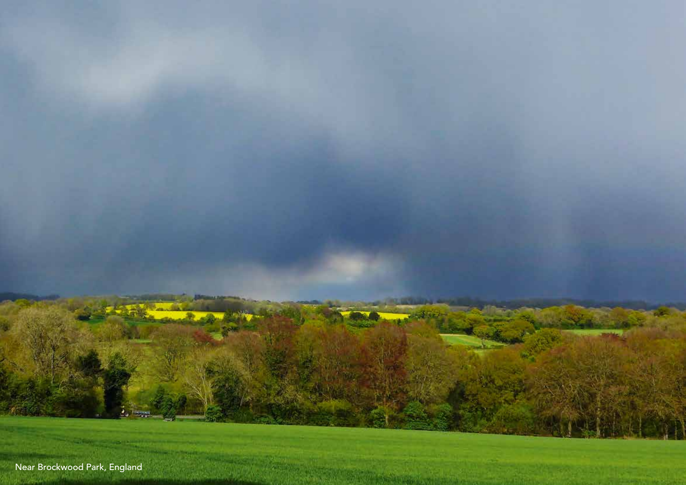
Near Brockwood Park, England