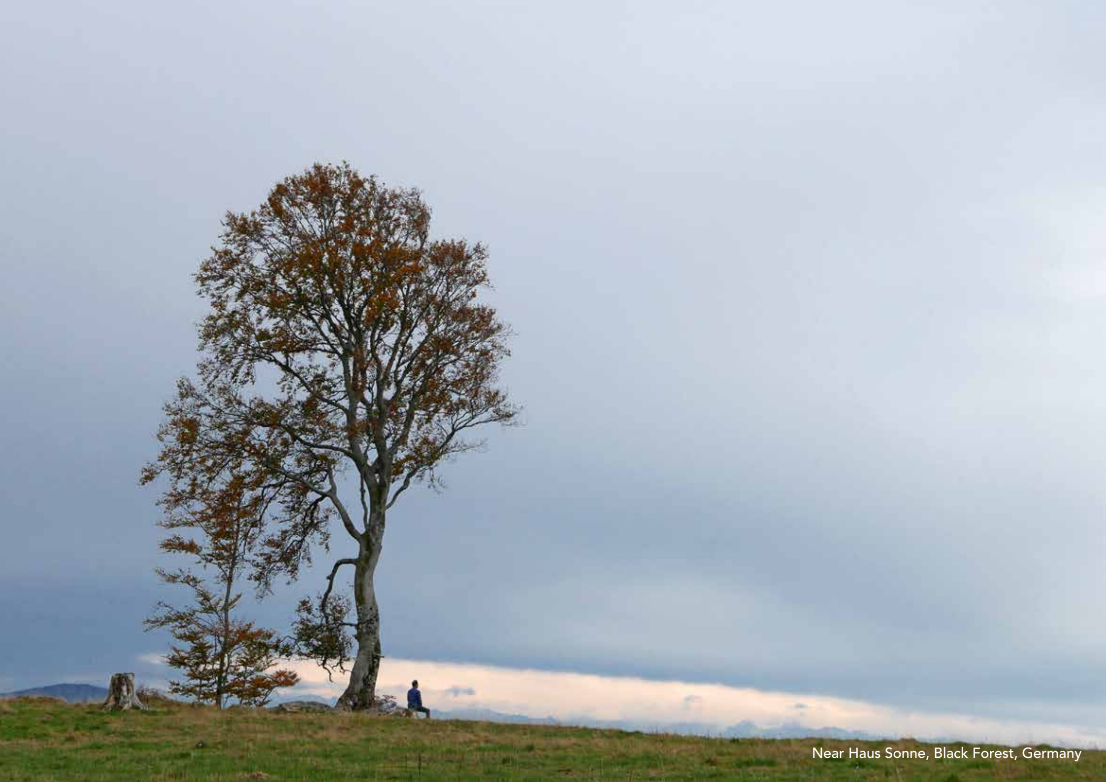
Near Haus Sonne, Black Forest, Germany