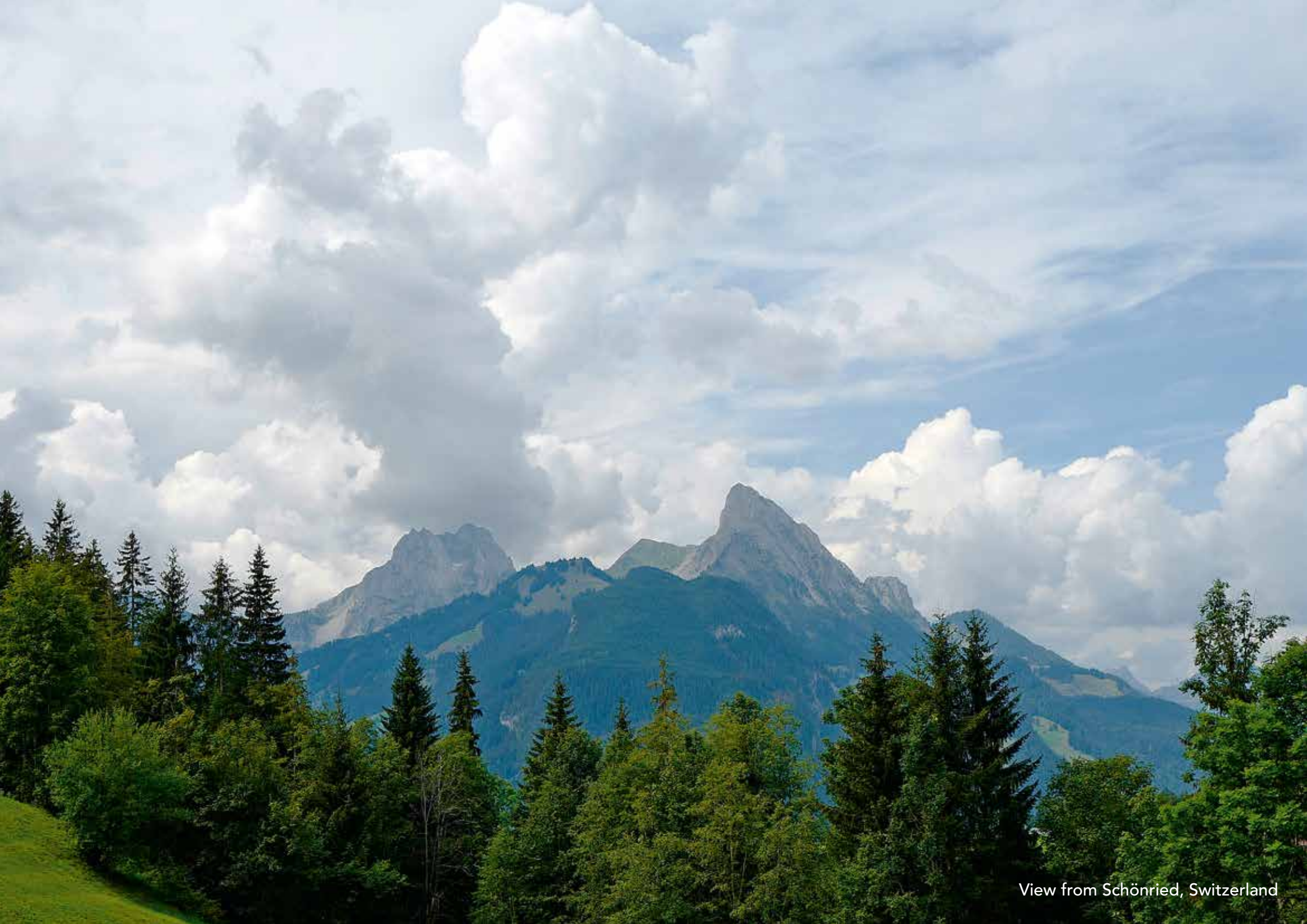
View from Schönried, Switzerland