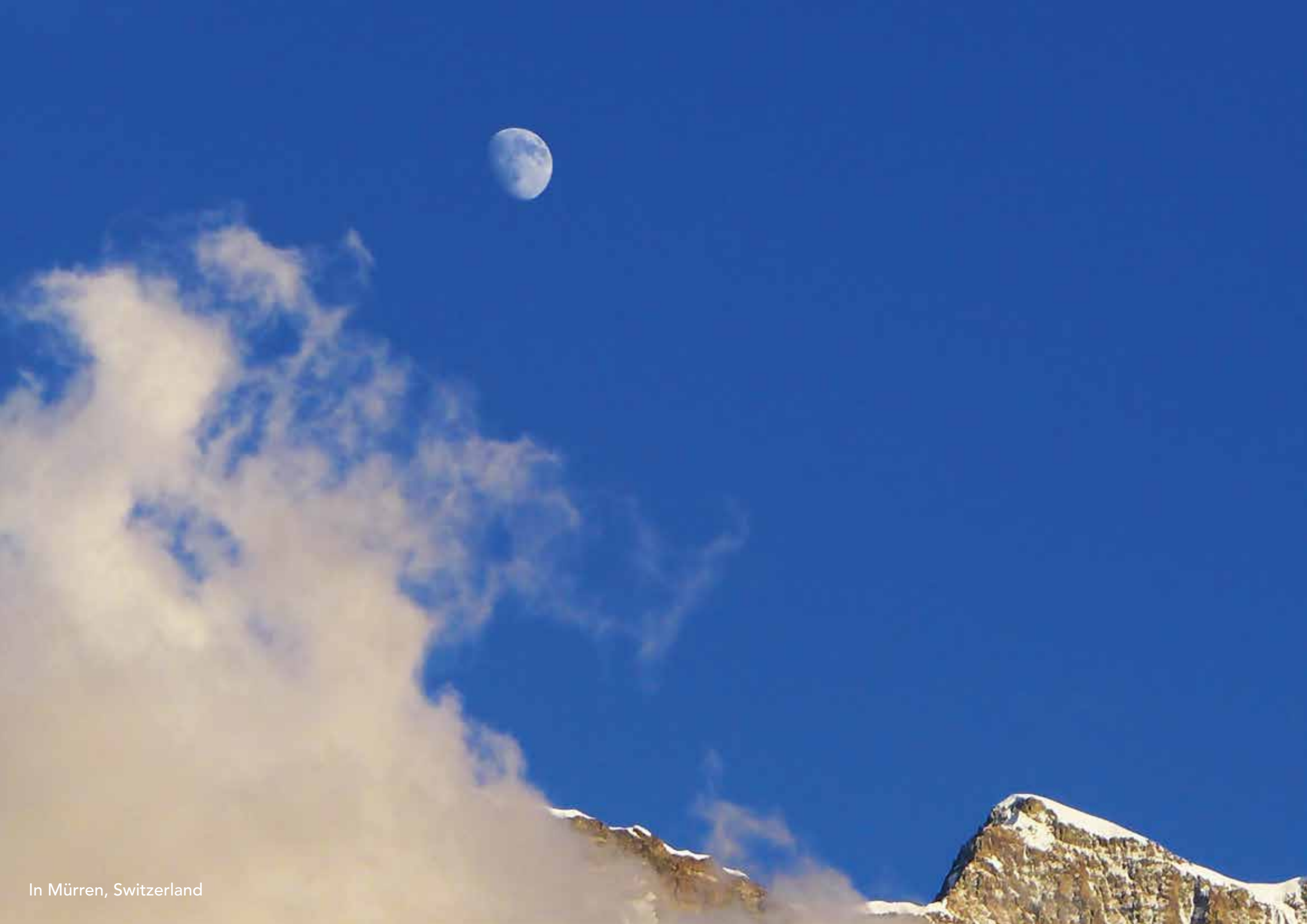
In Mürren, Switzerland