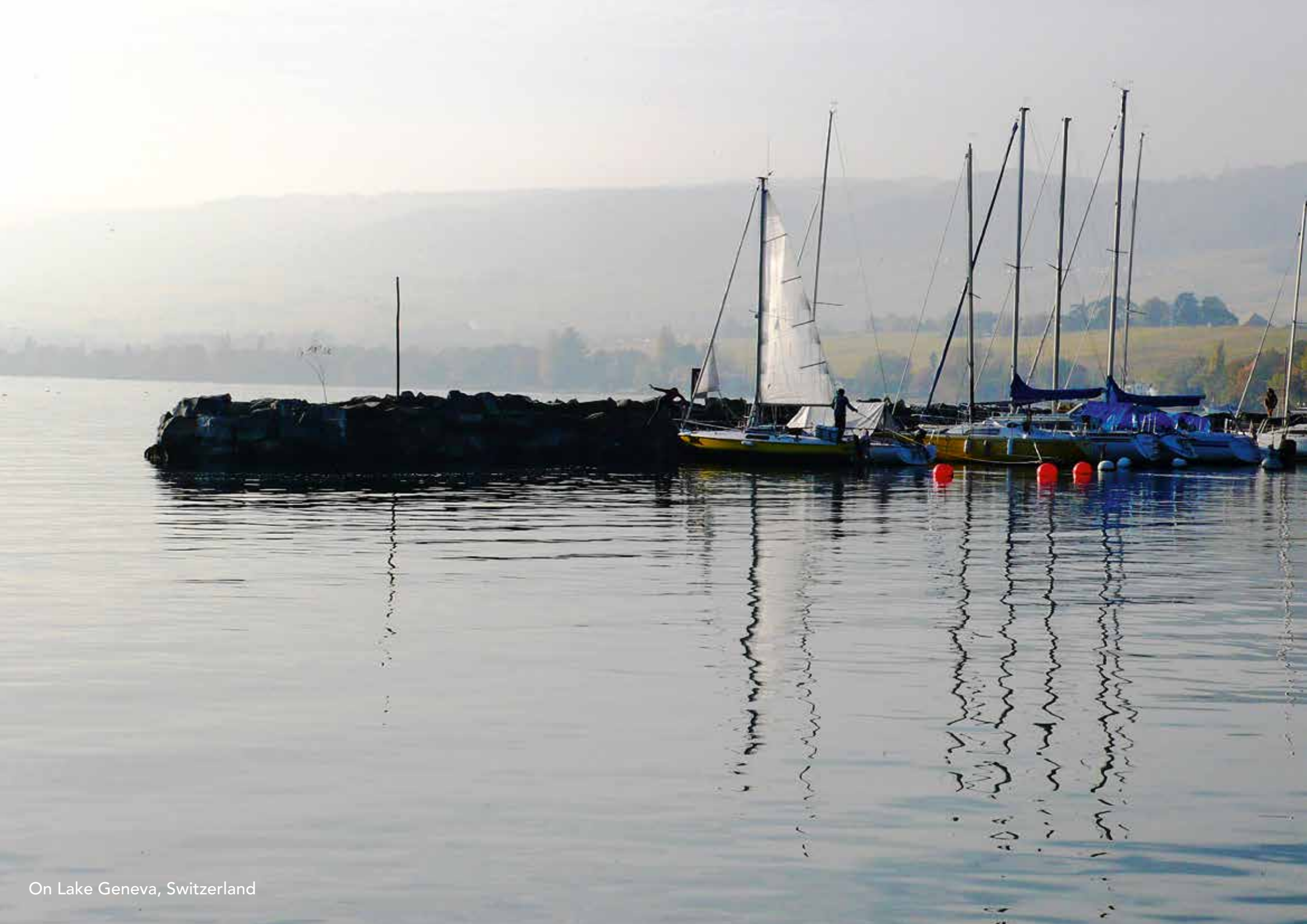
On Lake Geneva, Switzerland