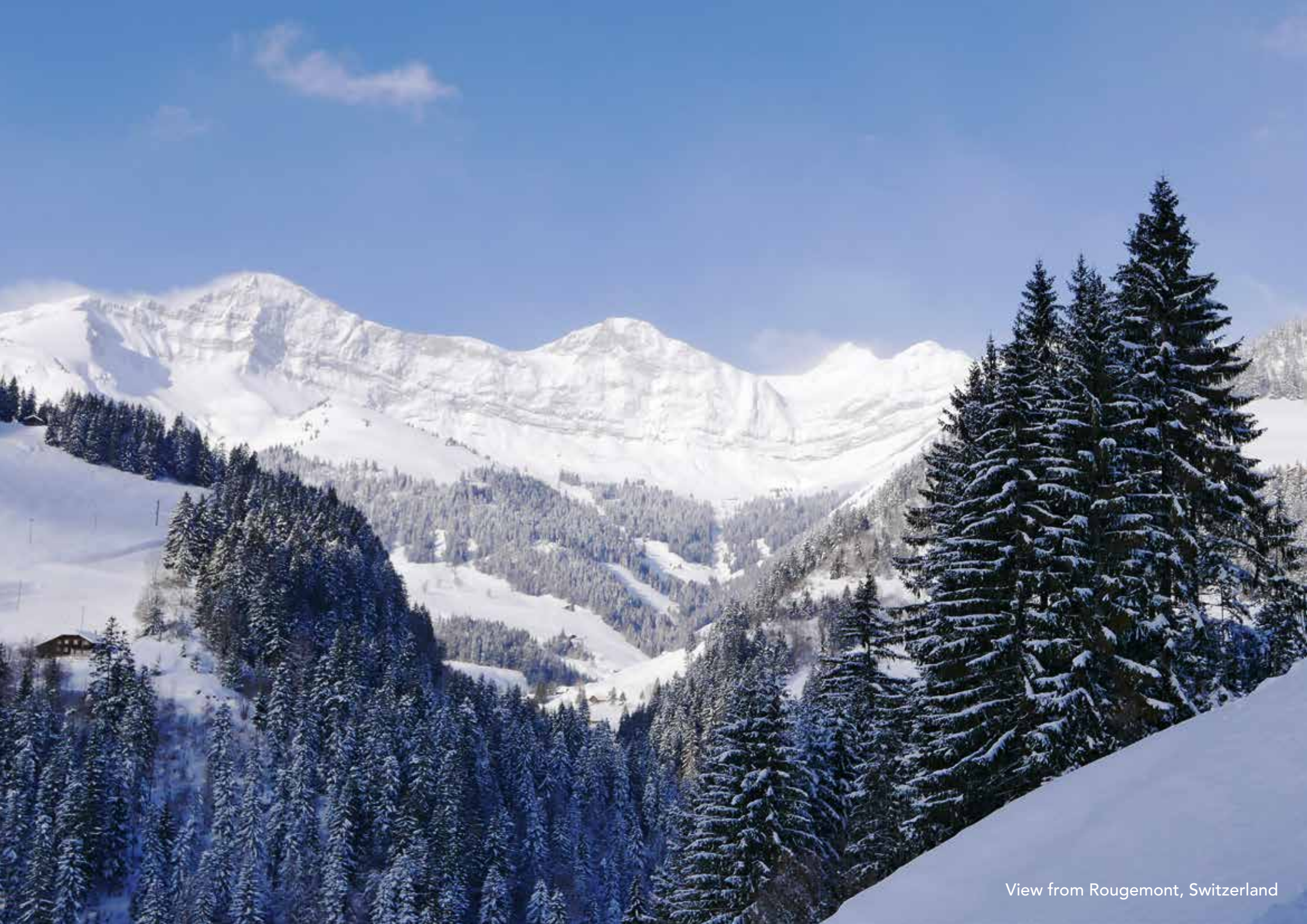
View from Rougemont, Switzerland