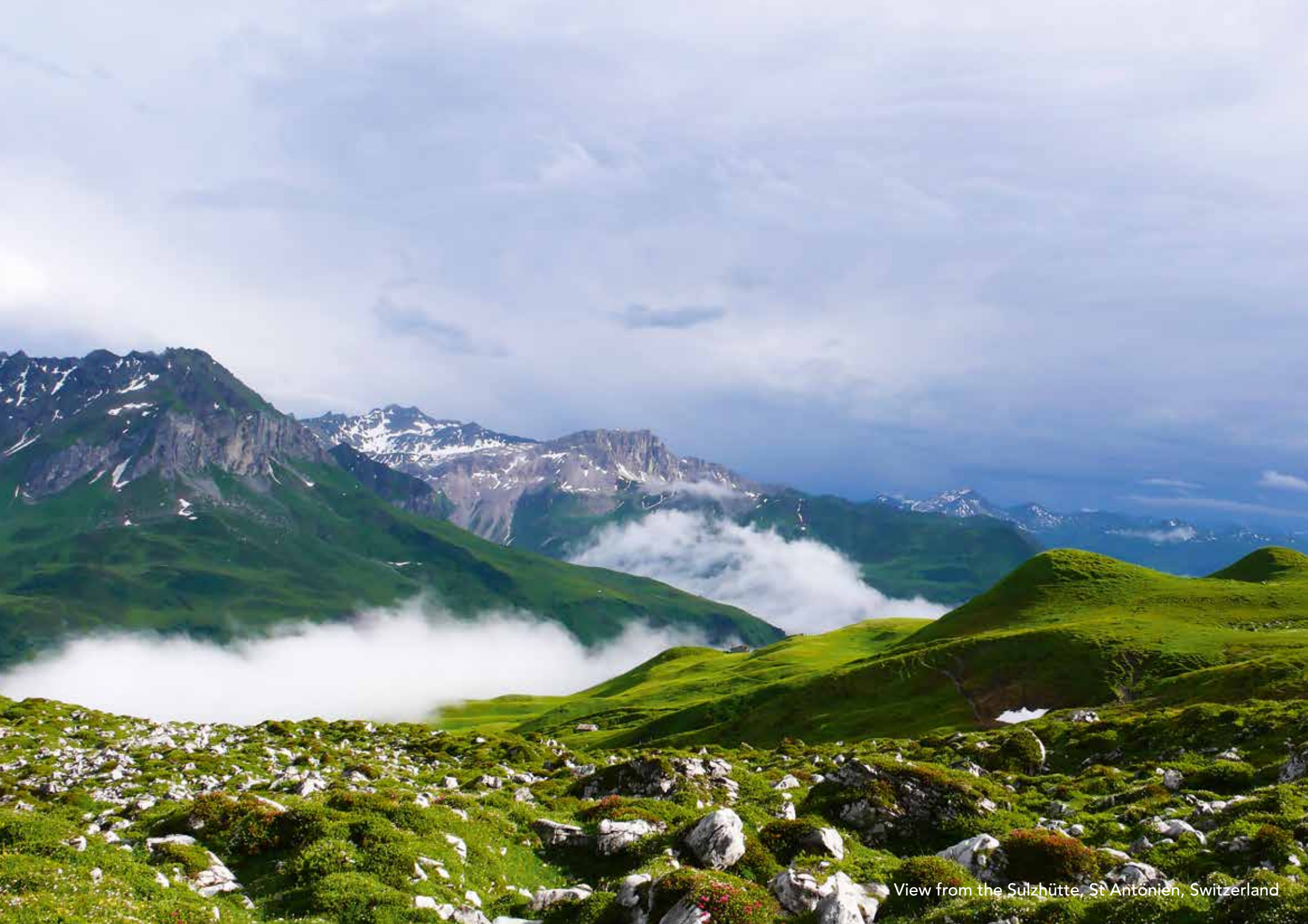
View from the Sulzhütte, St. Antonien, Switzerland