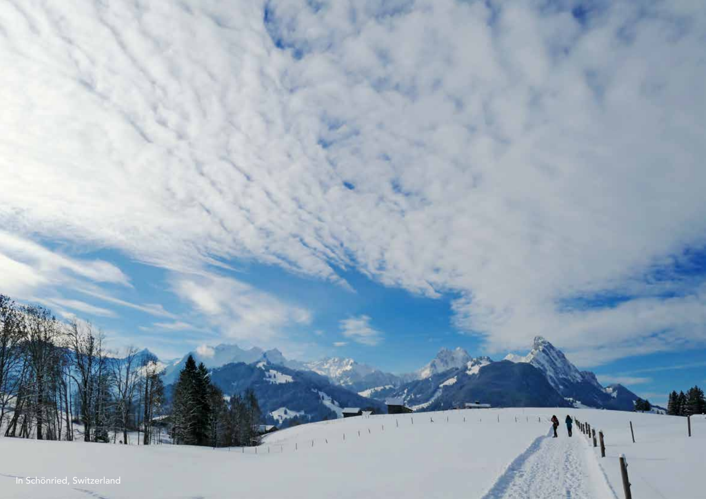
In Schönried, Switzerland