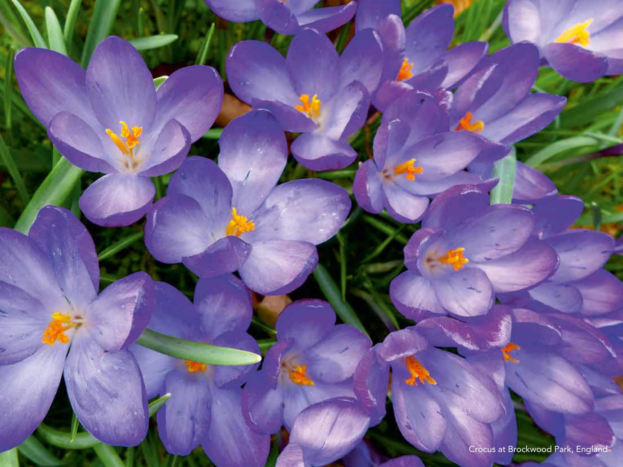
Crocus at Brockwood Park, England