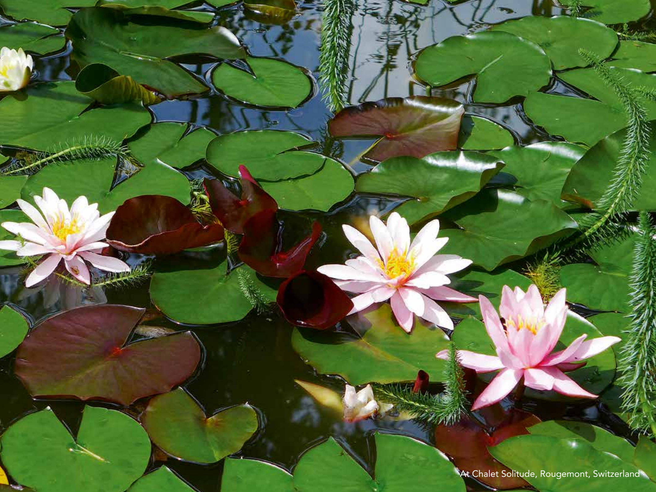
At Chalet Solitude, Rougemont, Switzerland