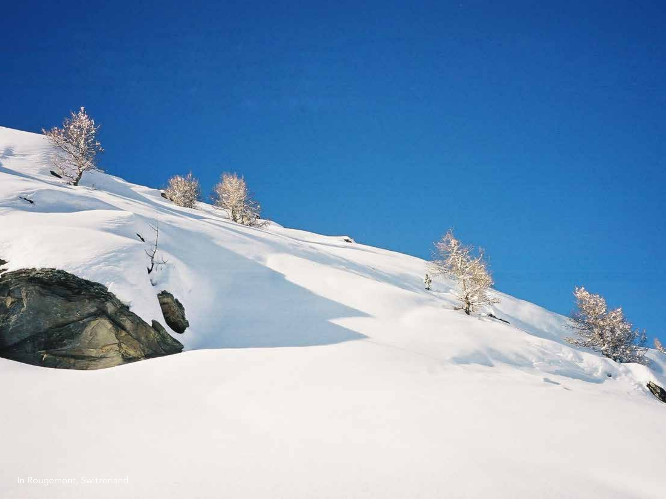
In Rougemont, Switzerland