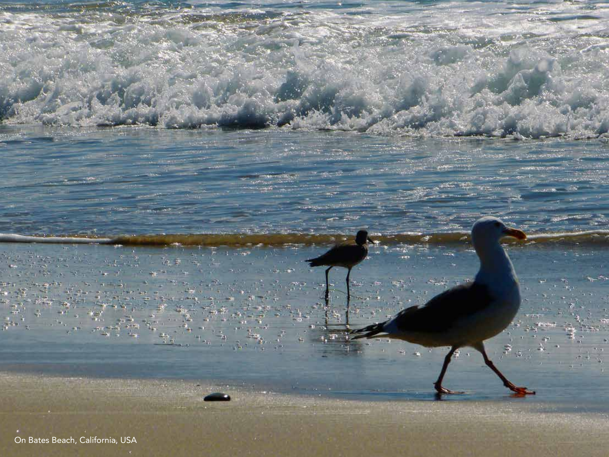
On Bates Beach, California, USA