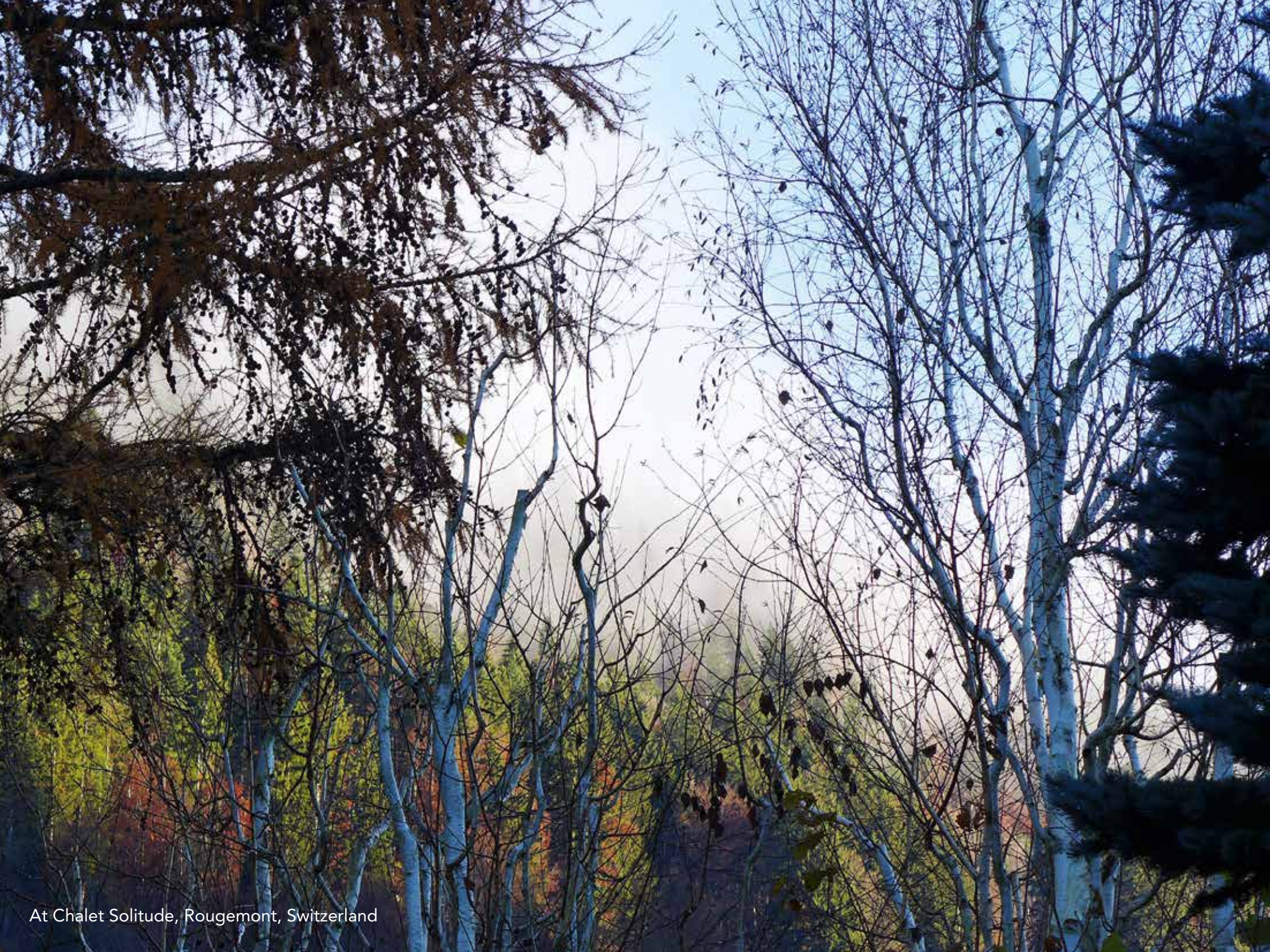
At Chalet Solitude, Rougemont, Switzerland