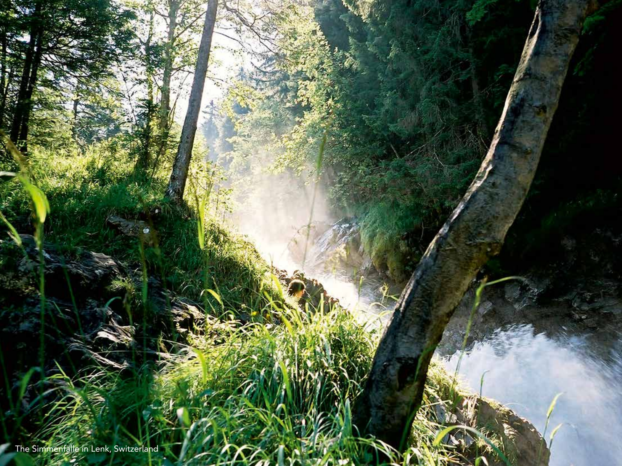
The Simmenfälle in Lenk, Switzerland