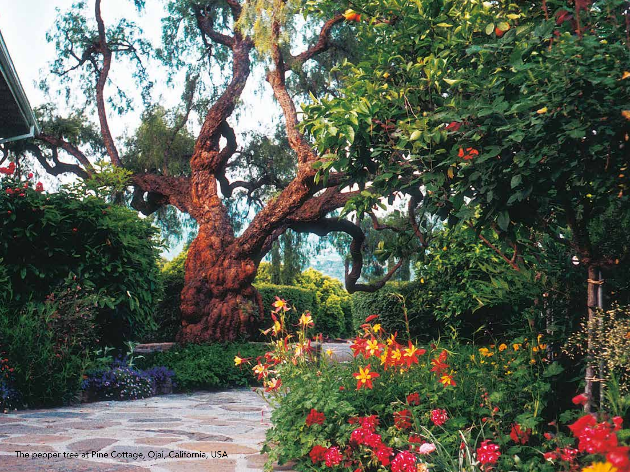
The pepper tree at Pine Cottage, Ojai, California, USA