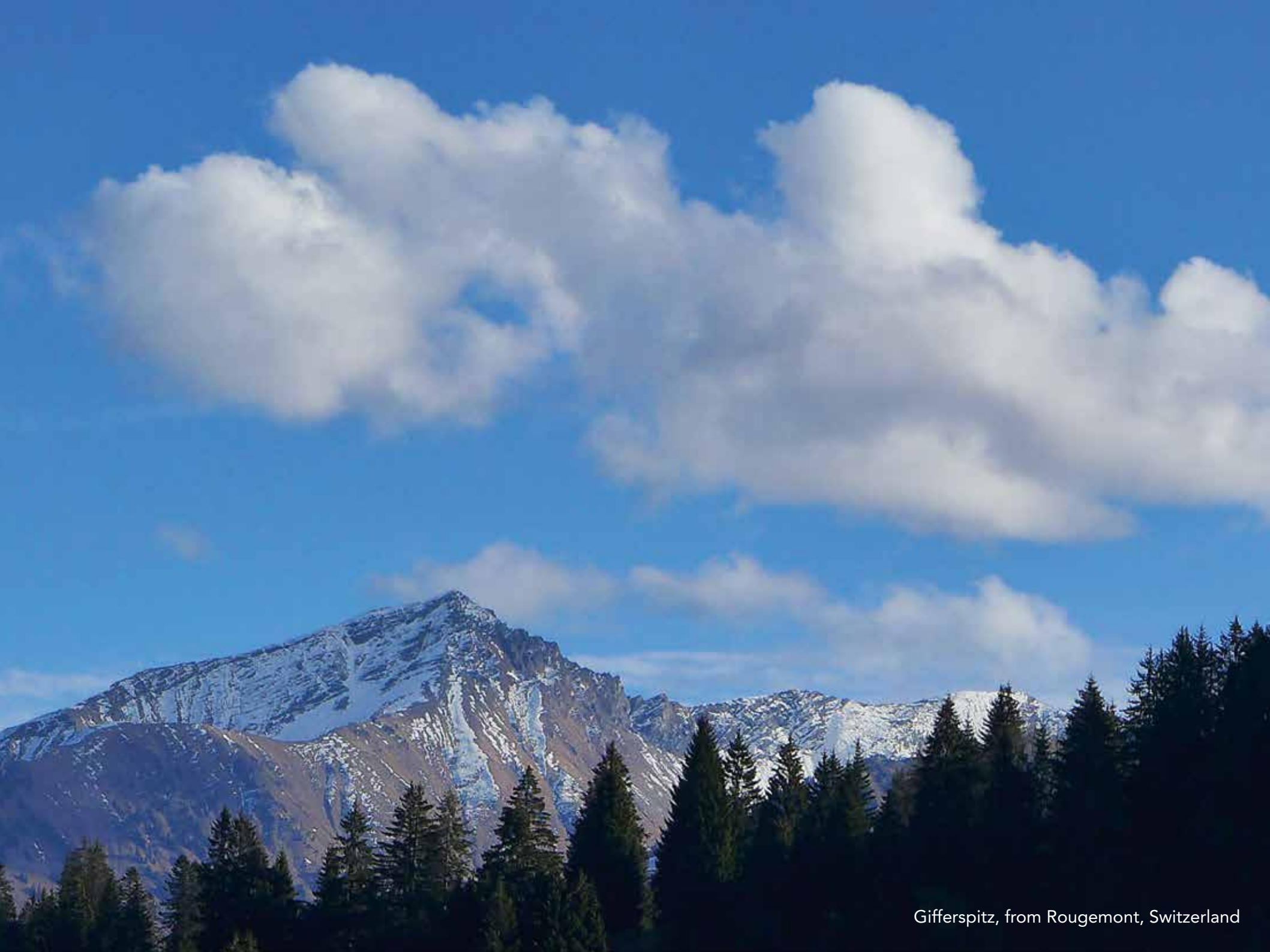
Gifferspitz, from Rougemont, Switzerland