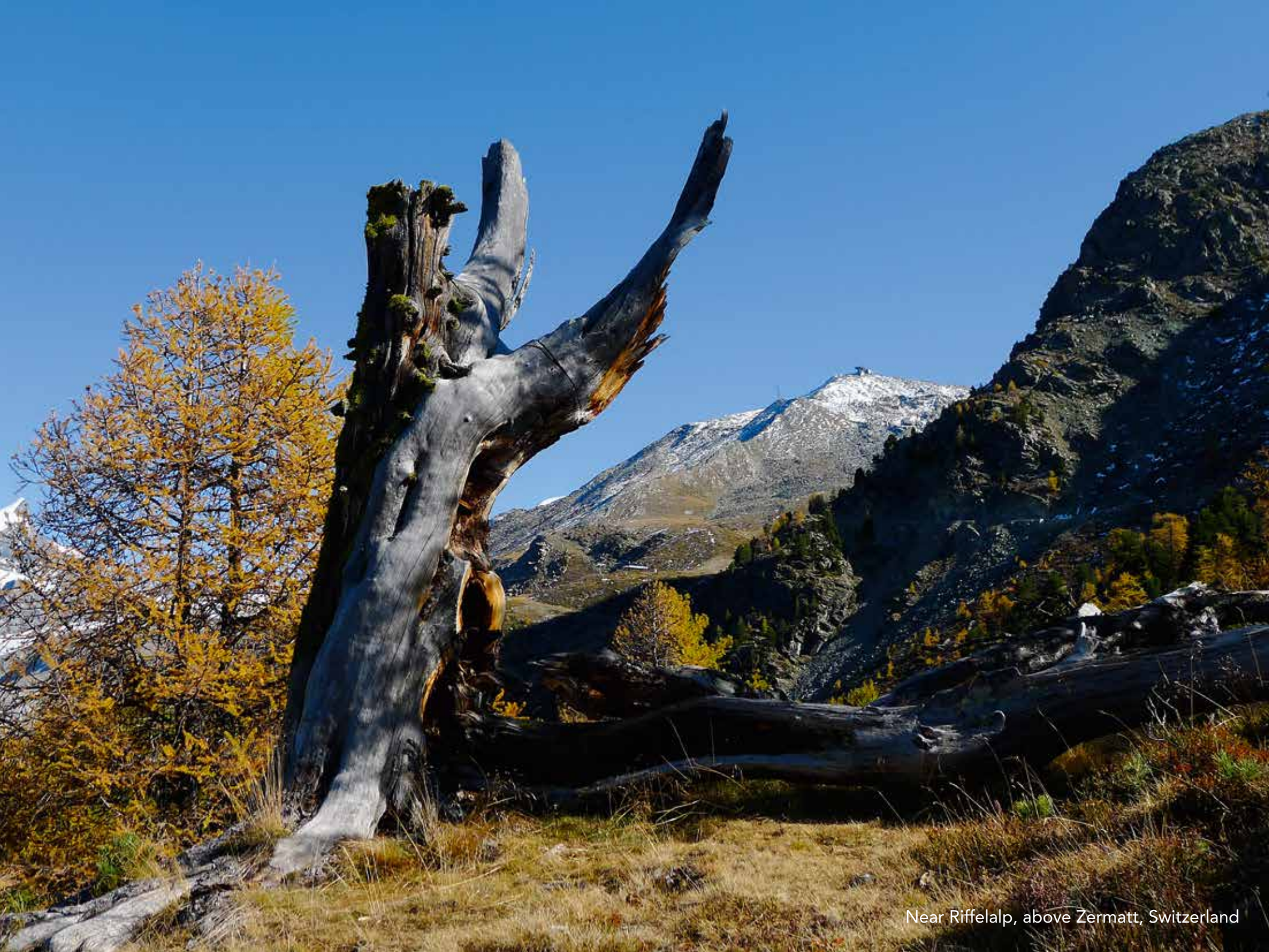
Near Riffelalp, above Zermatt, Switzerland