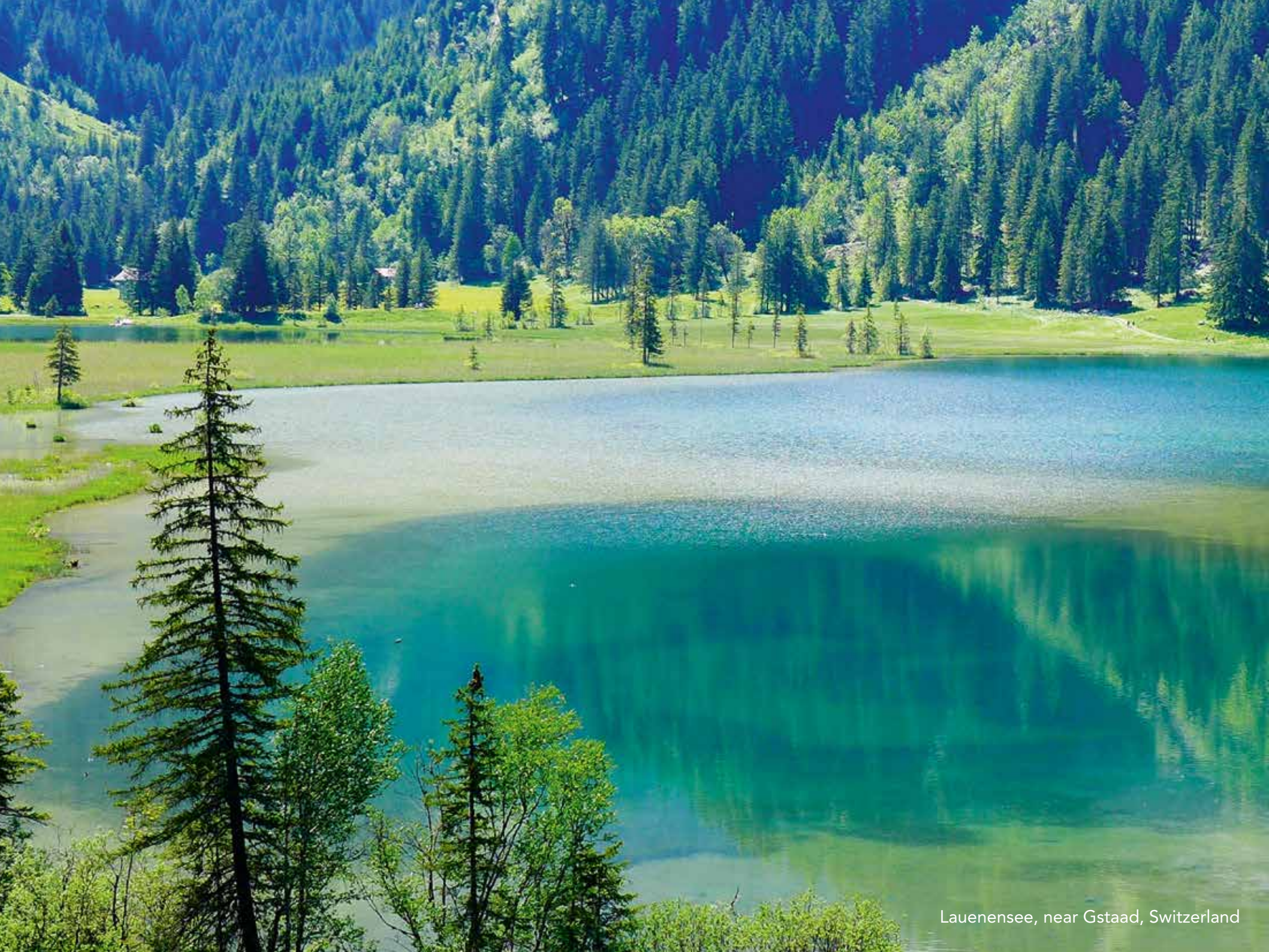
Lauenensee, near Gstaad, Switzerland