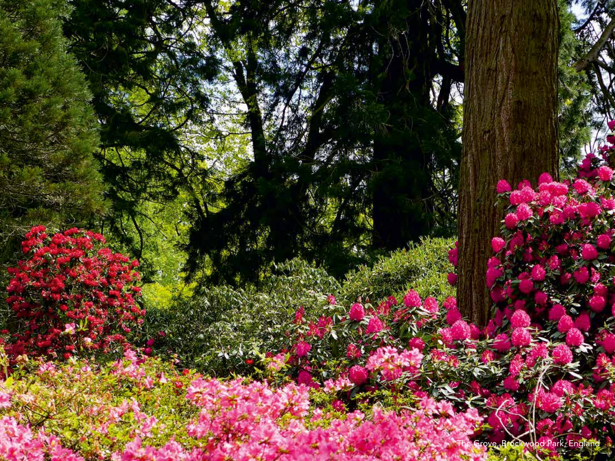
The Grove, Brockwood Park, England