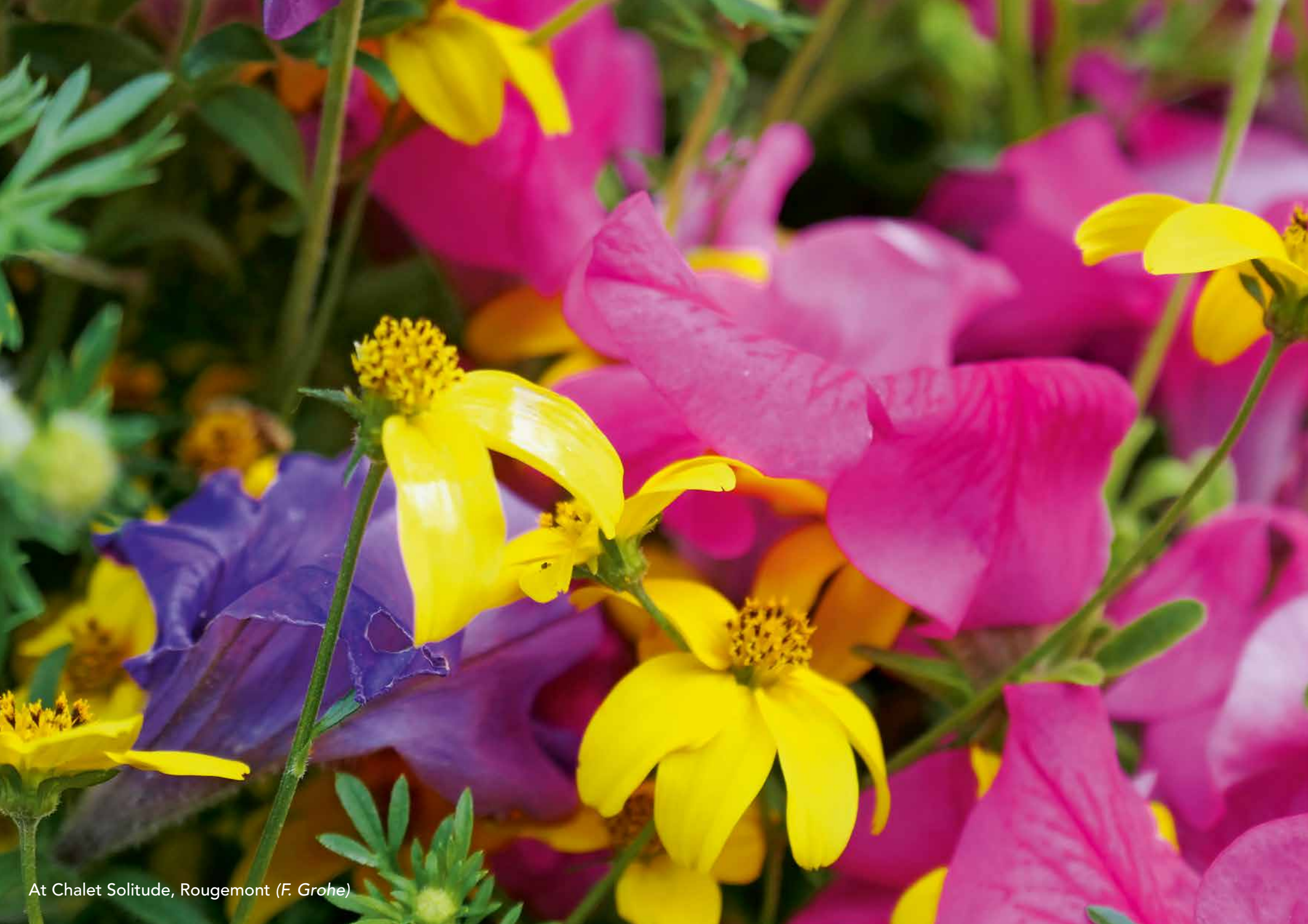
At Chalet Solitude, Rougemont (F. Grohe)