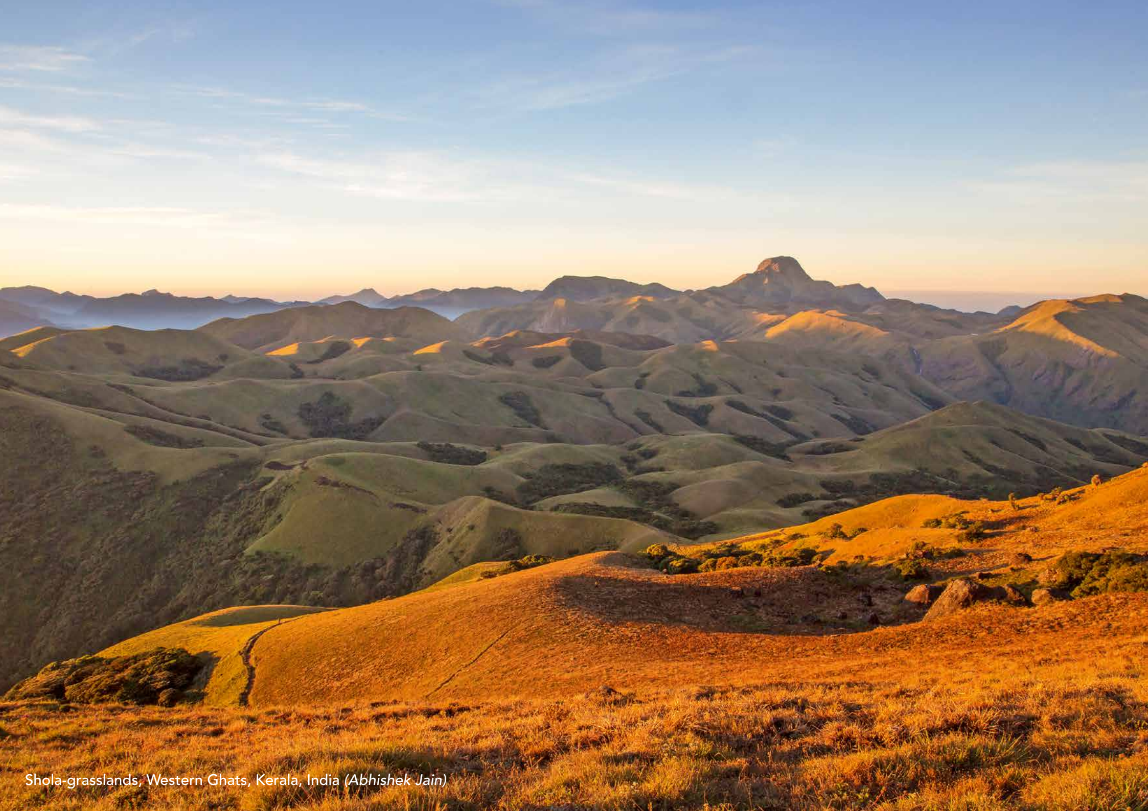
Shola-grasslands, Western Ghats, Kerala, India (Abhishek Jain)