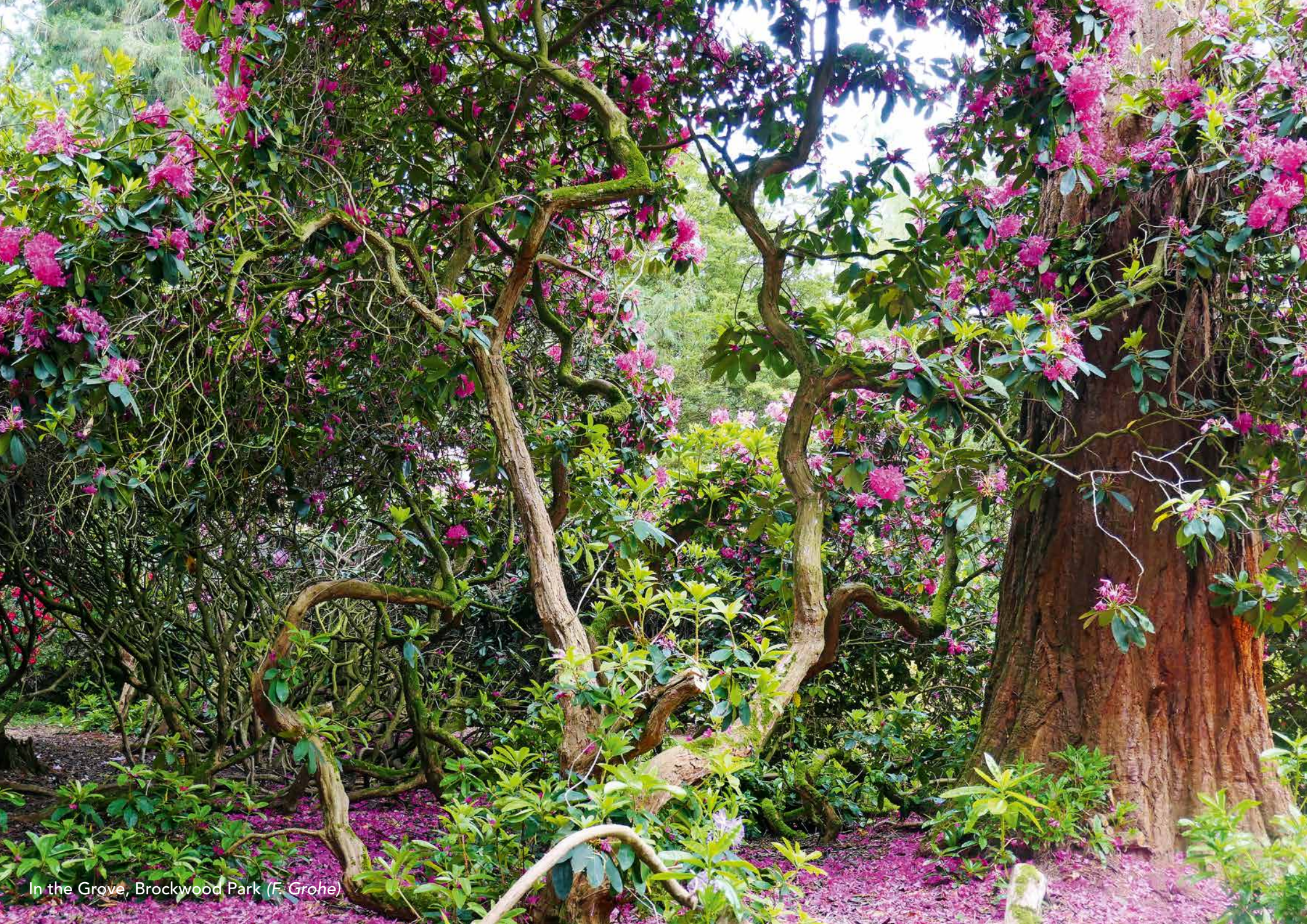
In the Grove, Brockwood Park (F. Grohe)