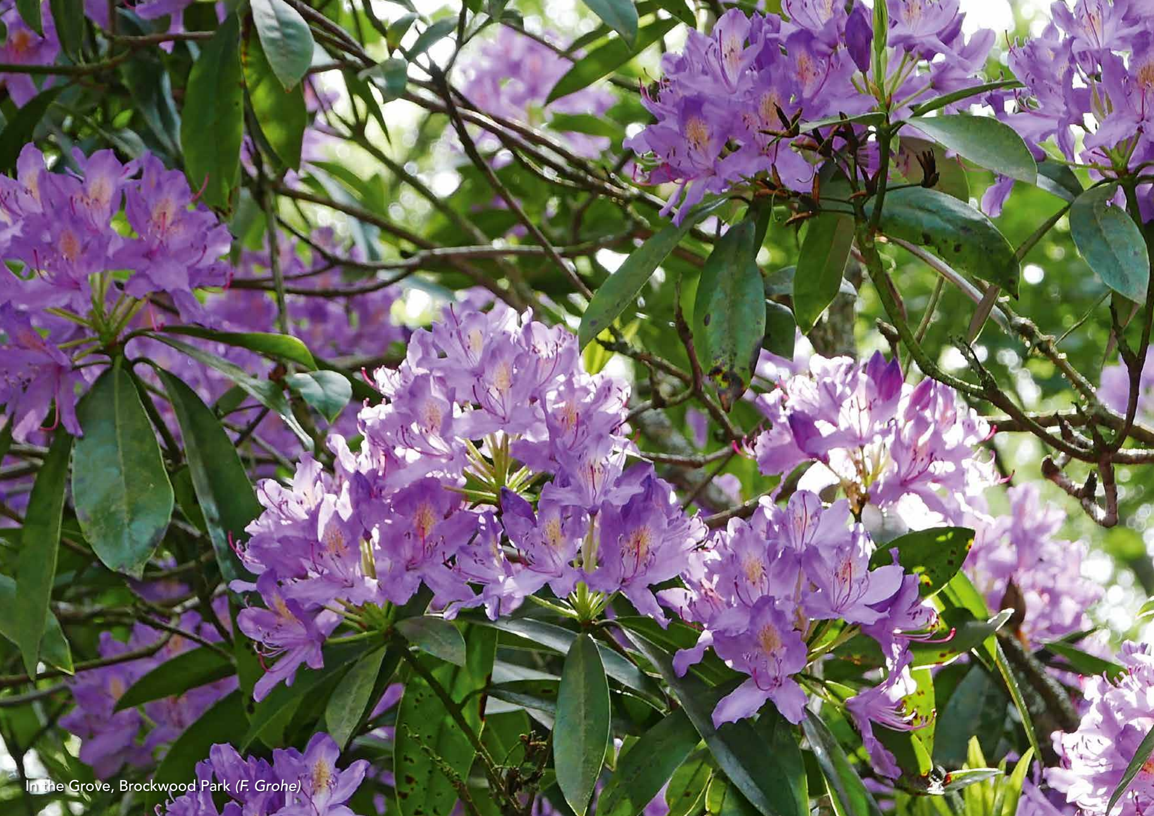
In the Grove, Brockwood Park (F. Grohe)