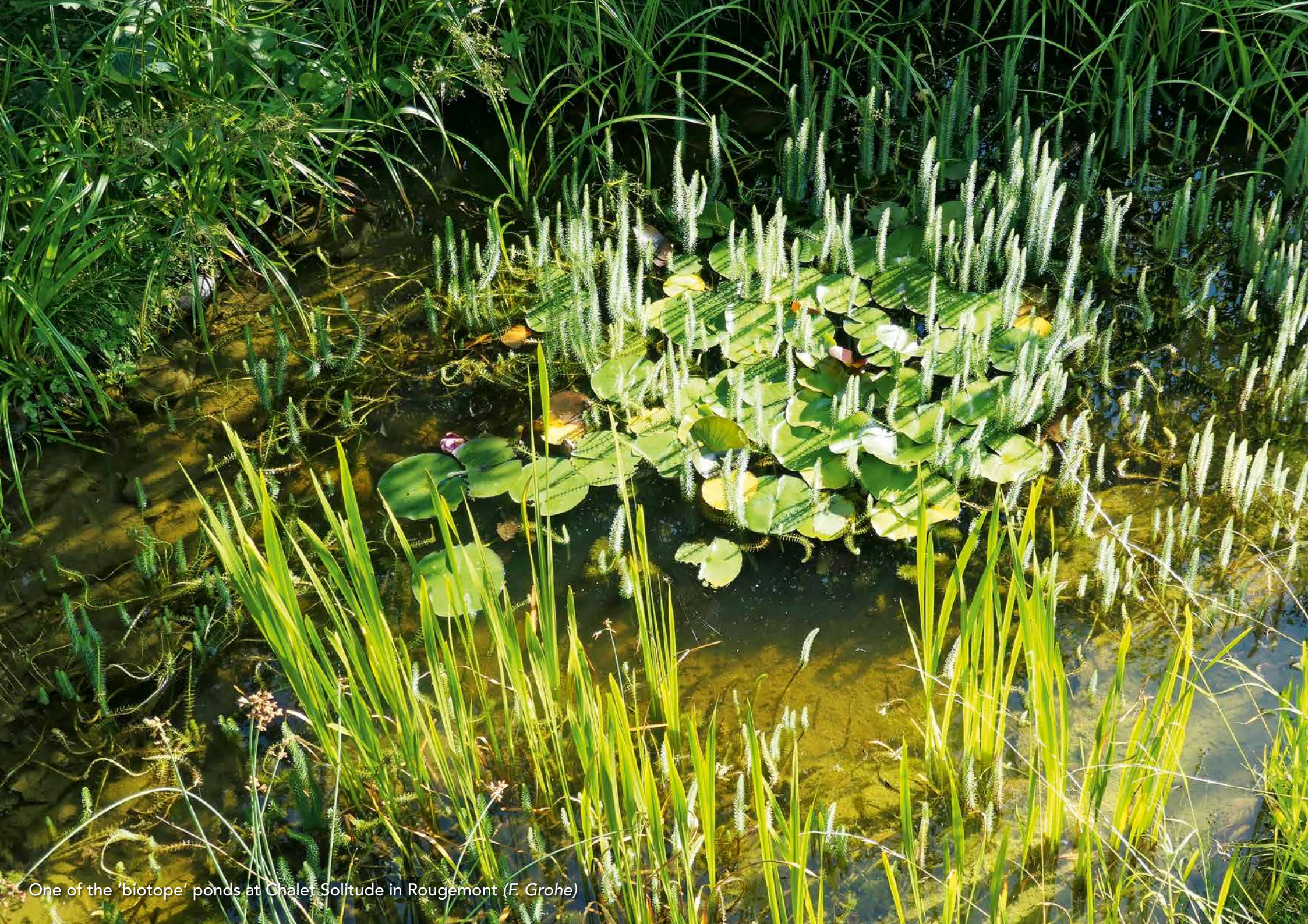
One of the 'biotope' ponds at Chalet Solitude in Rougemont (F. Grohe)