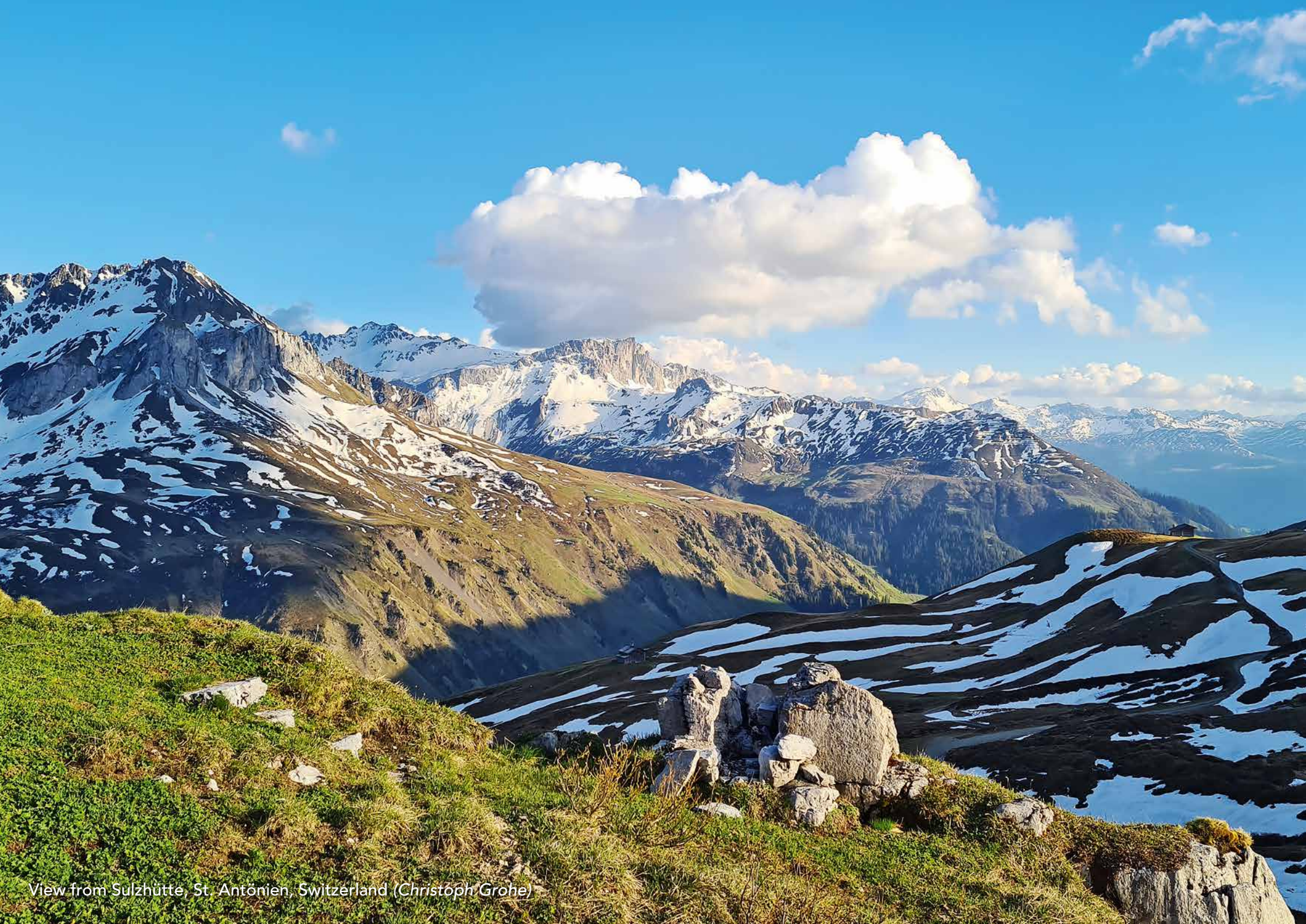
View from Sulzhütte, St. Antonien, Switzerland (Christoph Grohe)