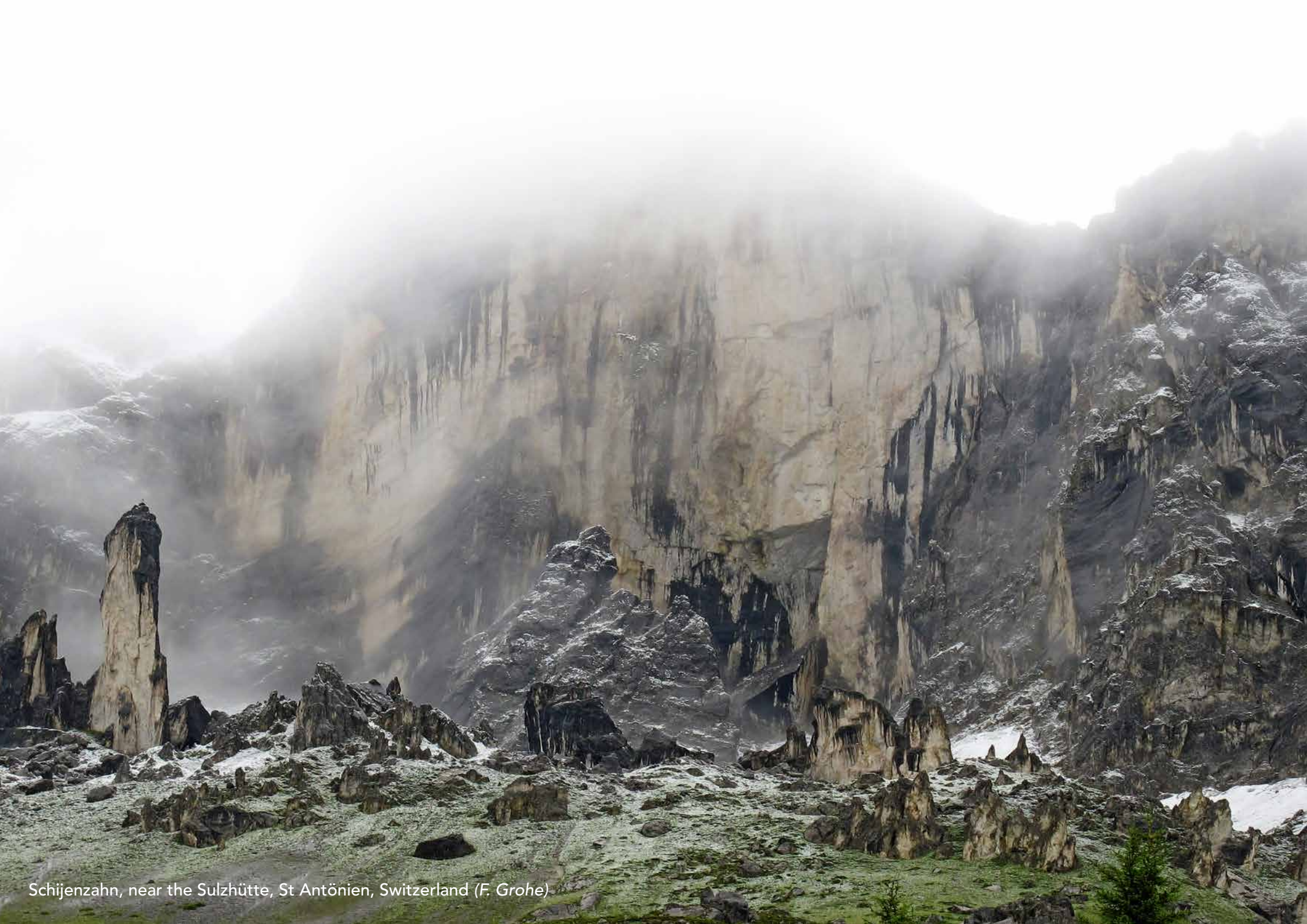
Schijen Zahn, near the Sulzhütte, St Antonien, Switzerland