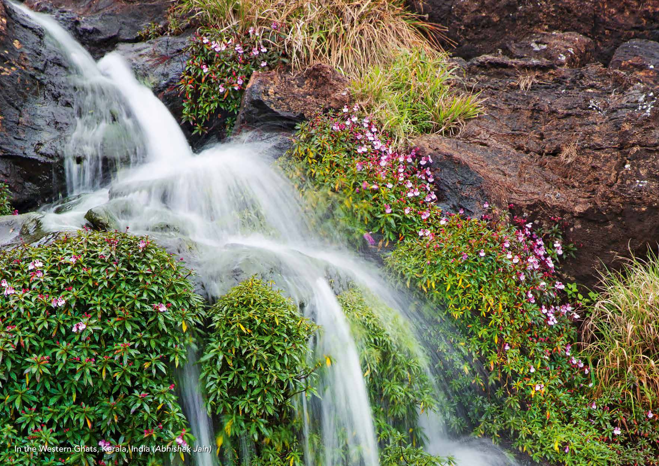
In the Western Ghats, Kerala, India