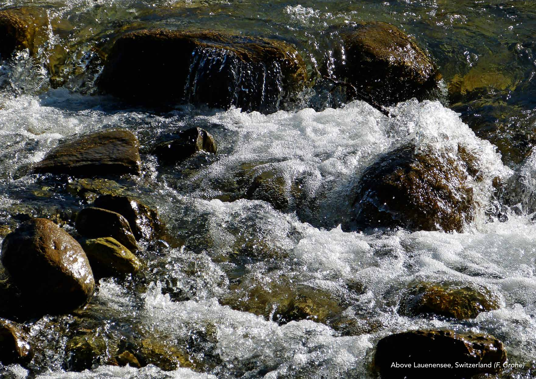
Above Lauenensee, Switzerland