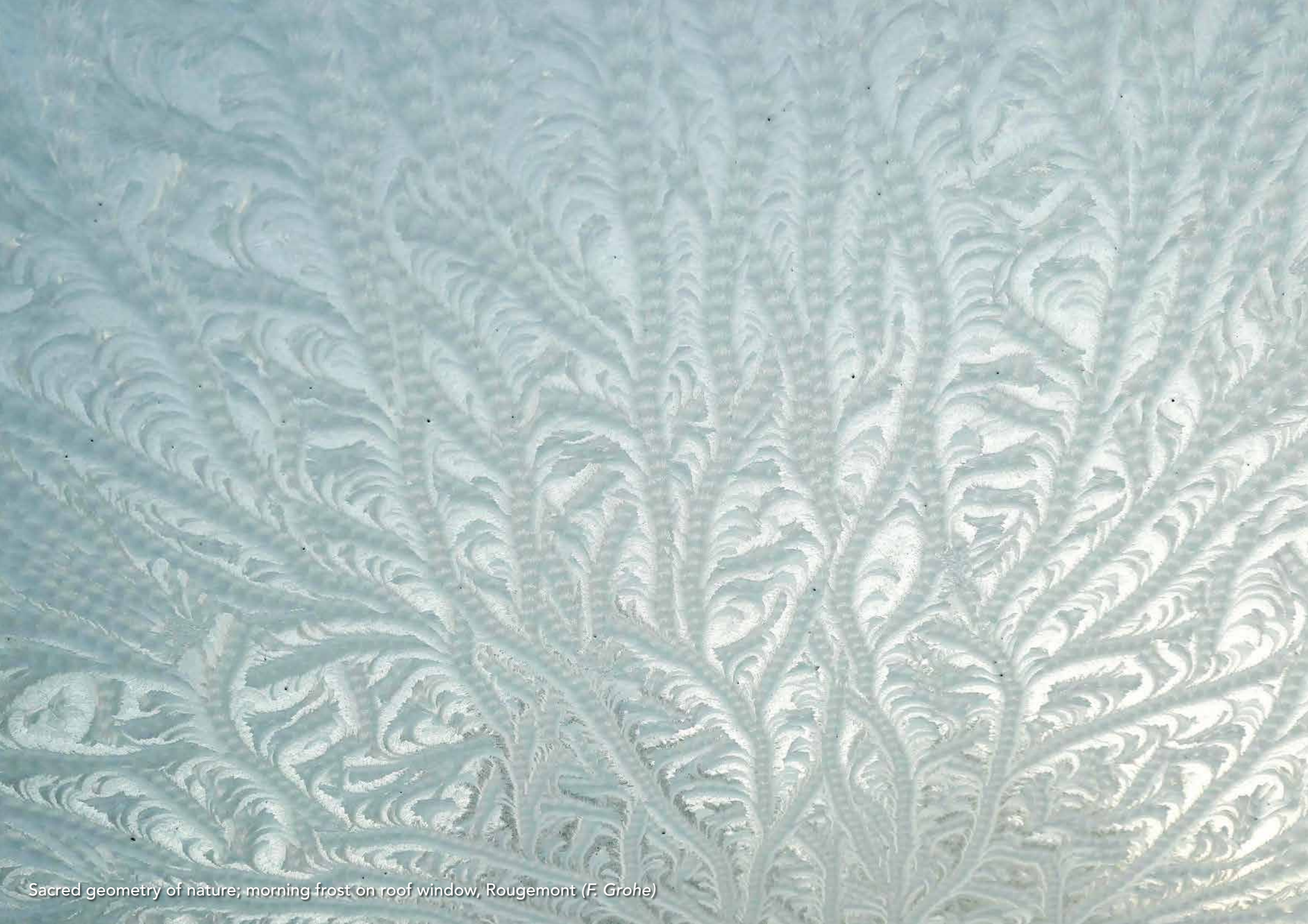
Sacred geometry of nature; morning frost on roof window, Rougemont (F. Grohe)