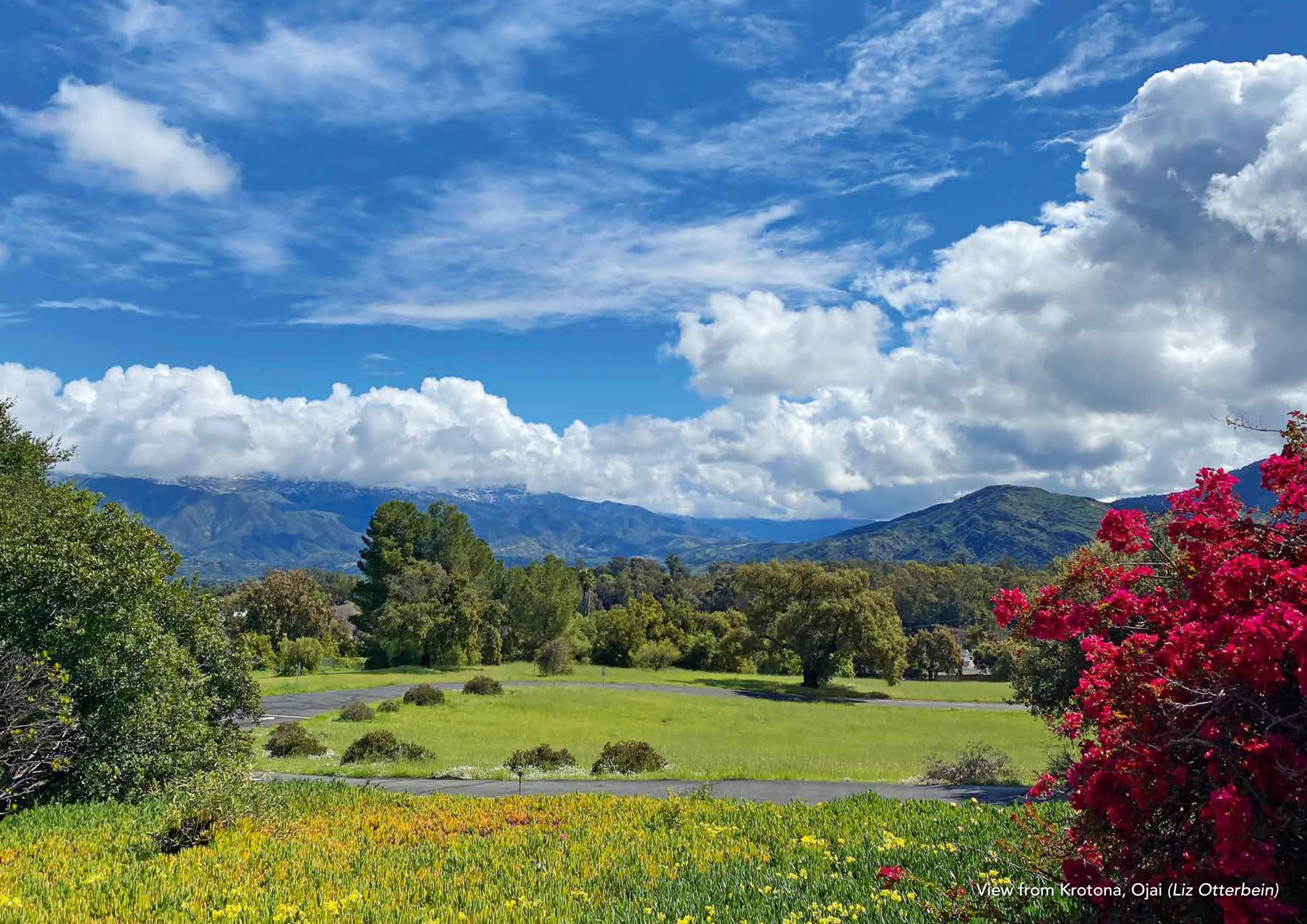
View from Krotona, Ojai (Liz Otterbein)