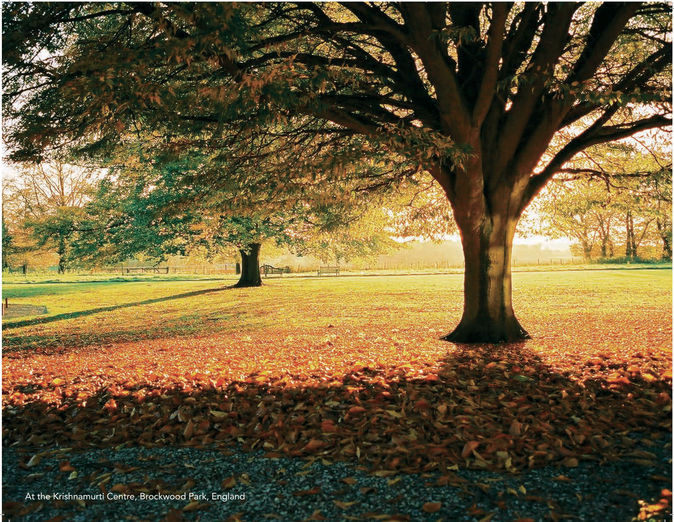
At the Krishnamurti Centre, Brockwood Park, England