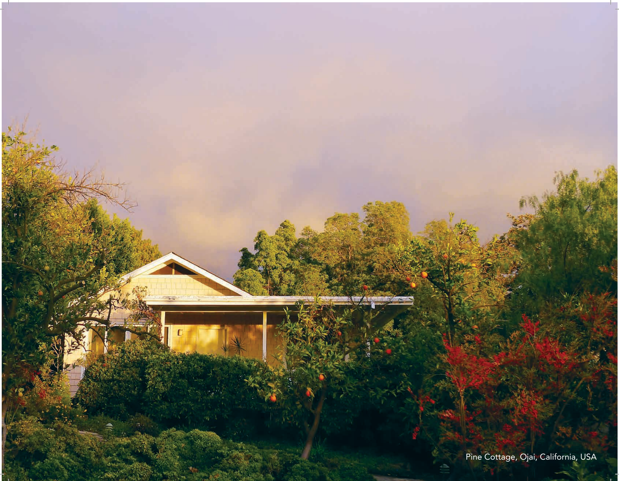
Pine Cottage, Ojai, California, USA