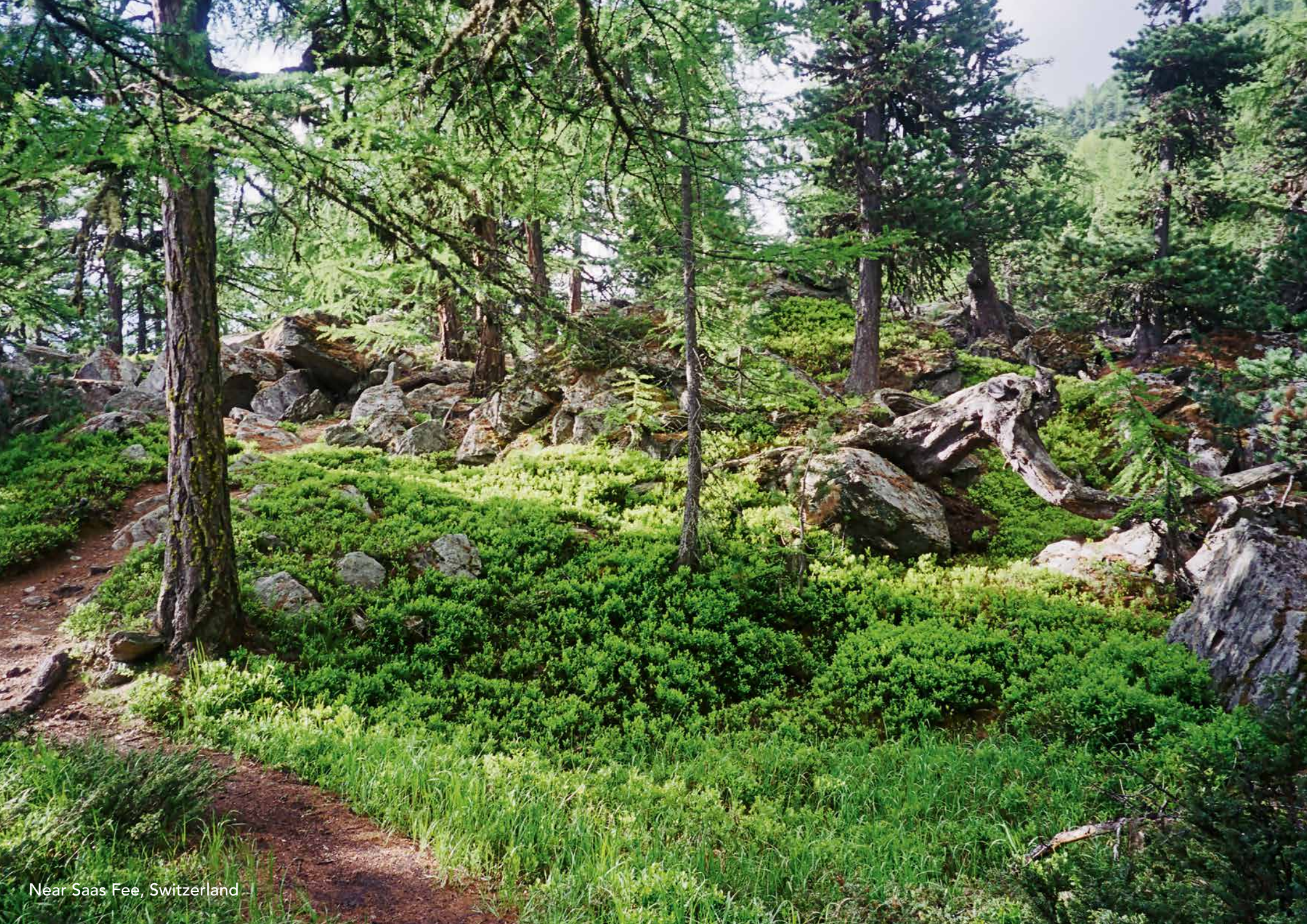
Near Saas Fee, Switzerland