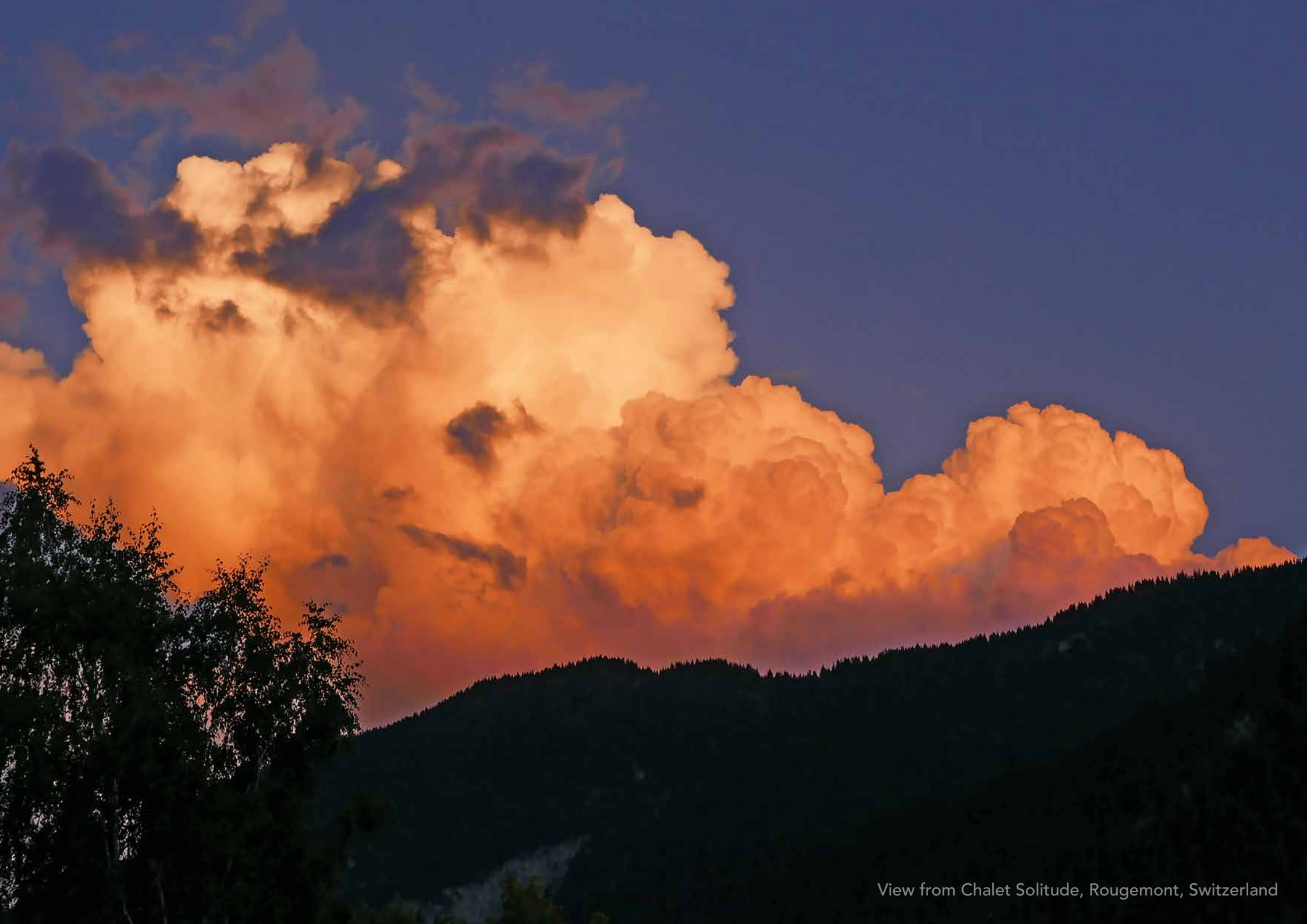
View from Chalet Solitude, Rougemont, Switzerland