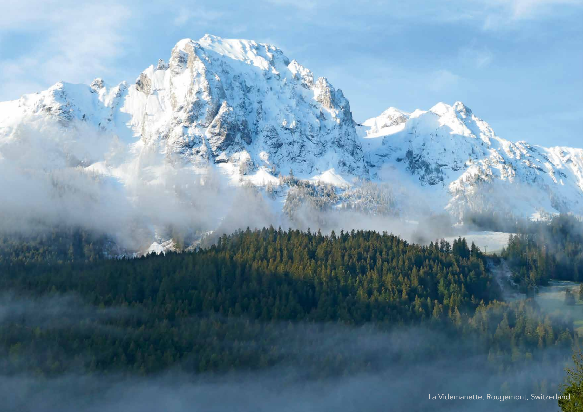
La Videmanette, Rougemont, Switzerland