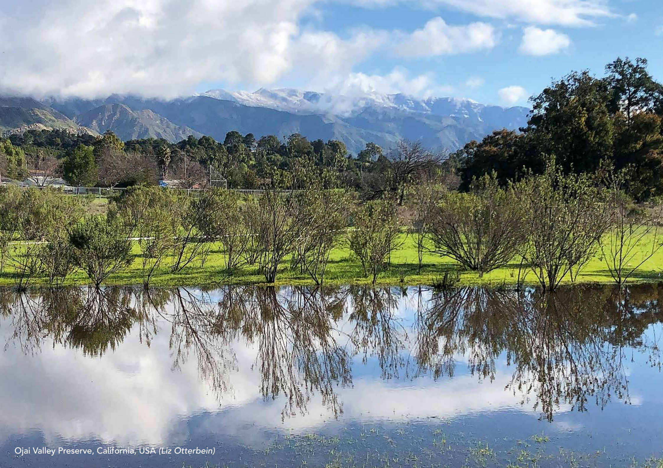
Ojai Valley Preserve, California, USA (Liz Otterbein)