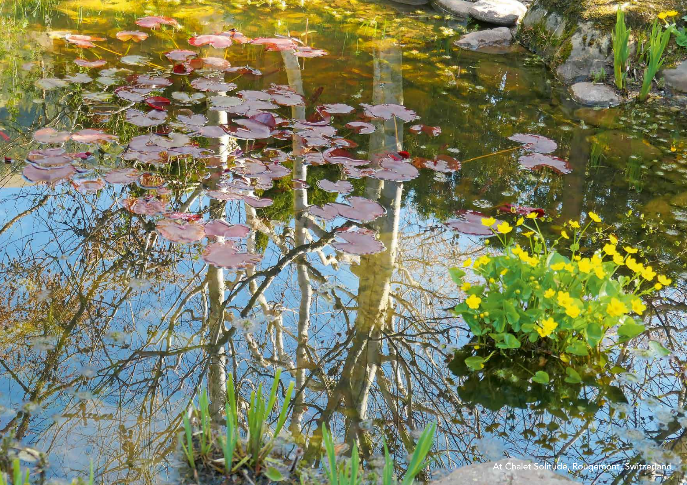
At Chalet Solitude, Rougemont, Switzerland