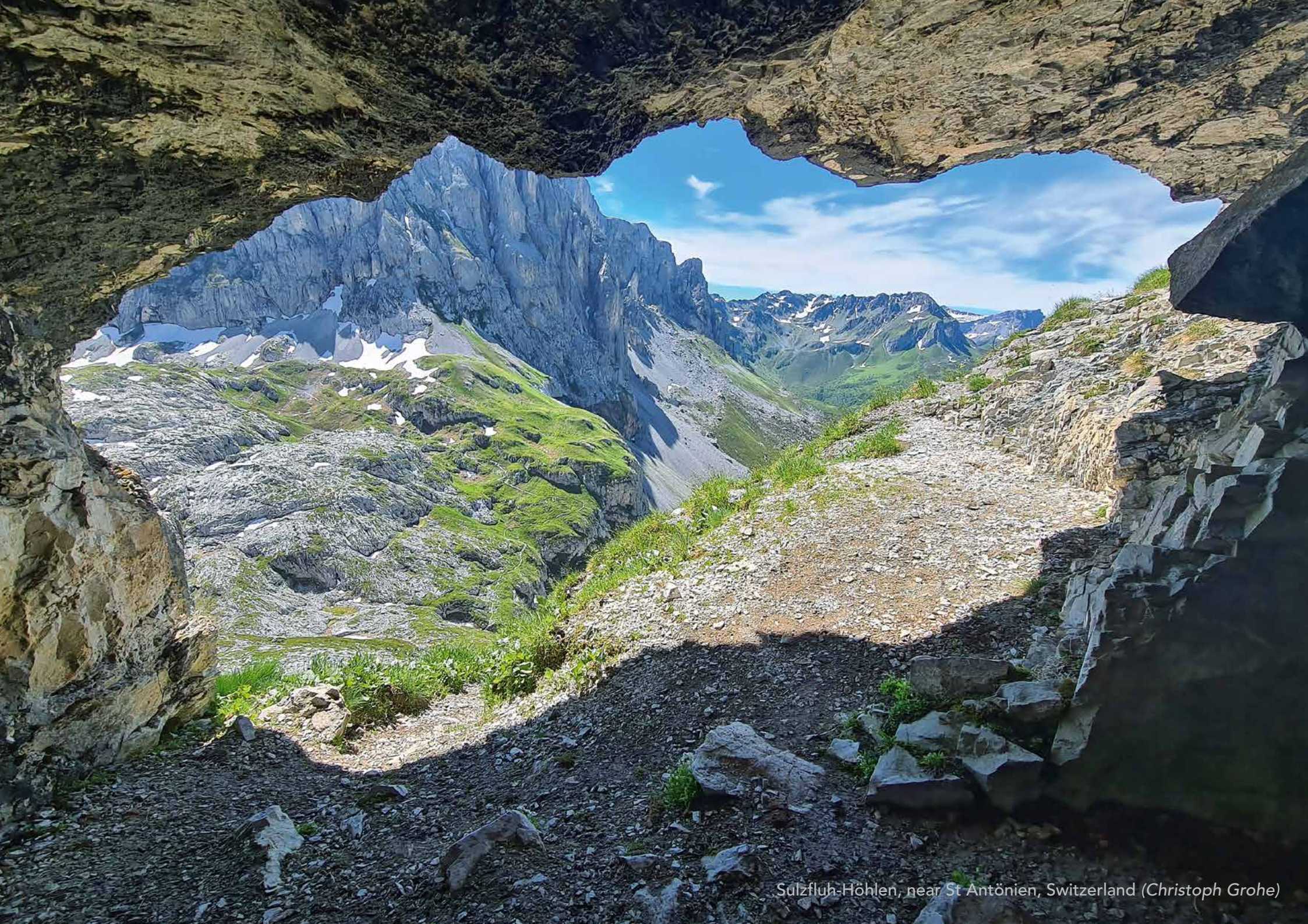
Sulzfluh-Höhlen, near St Antönien, Switzerland