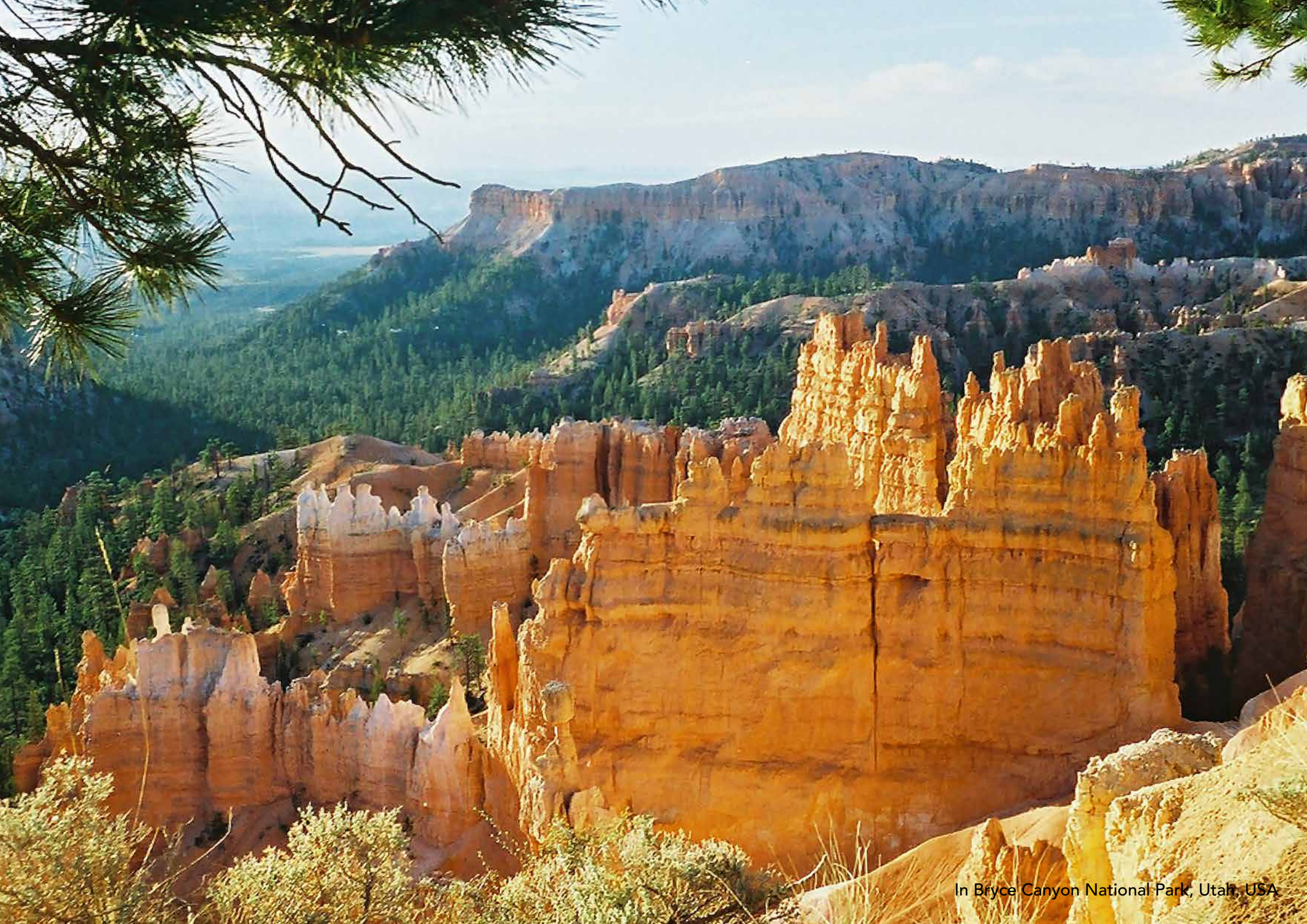
In Bryce Canyon National Park, Utah, USA