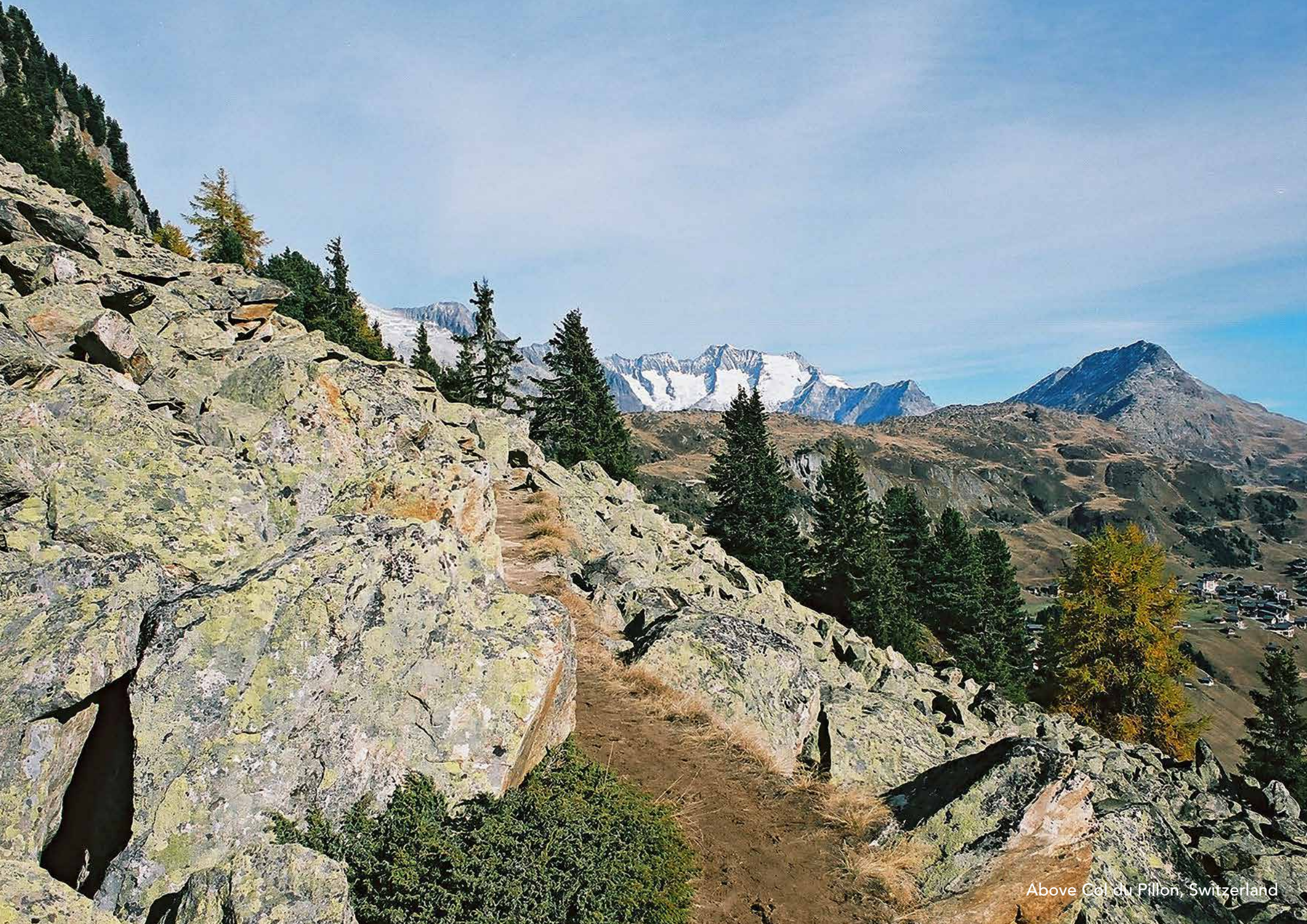
Above Col du Pillon, Switzerland