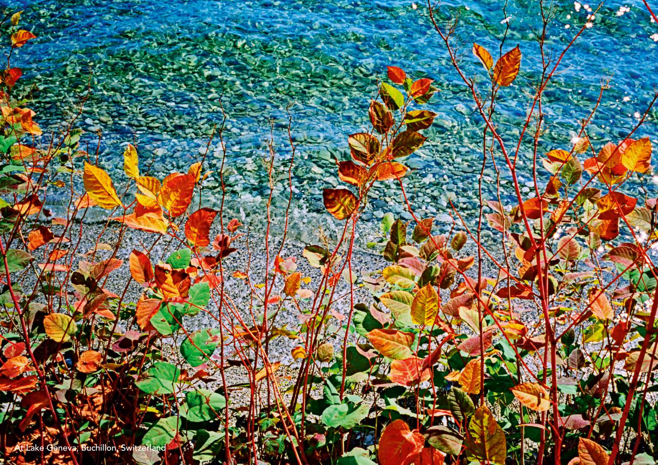
At Lake Geneva; Buchillon, Switzerland