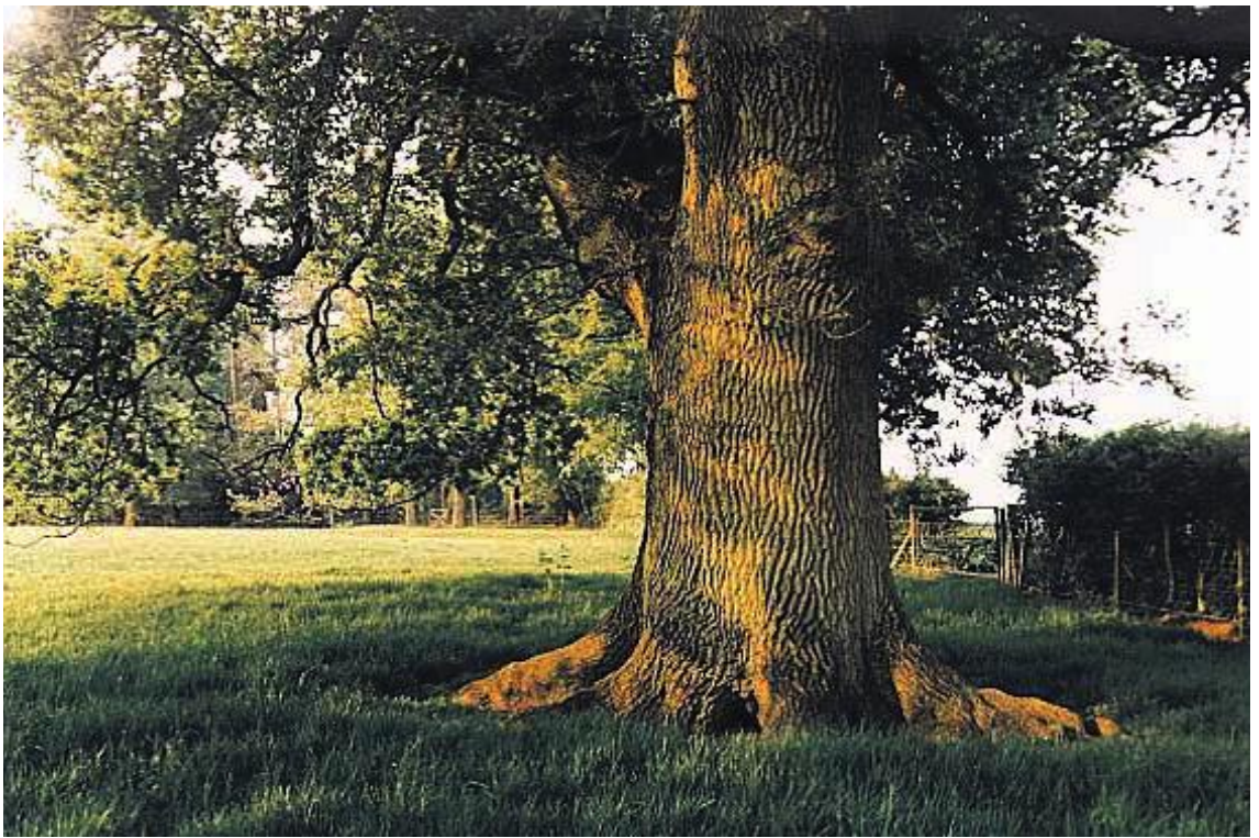
Oak tree beside the grove, Brockwood Park, England

Assuming it was a quotation from Krishnamurti, I eagerly went to the CD-ROM to find its source. After much searching, I was unable to find it. I then asked a couple of friends, avid students of the teachings, if they knew where this quotation came from. Neither knew. Then I began to wonder if I was looking for verification from Krishnamurti as the final authority as to why one should study the teachings. As I am still unable to verify its source, it remains an anonymous quotation, even though it reads like something Krishnamurti could have said.