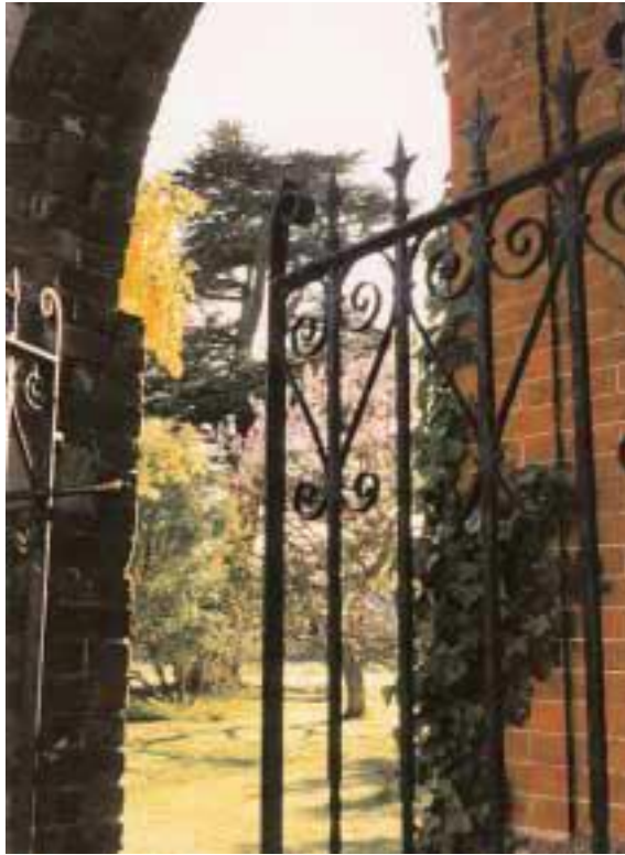
Gate from walled garden, Brockwood Park, England

The Link's function is not to spread the teachings, but to keep people informed of what is going on in the Krishnamurti information centres, schools, foundations and related projects; to give individuals the opportunity to report about their investigations, their activities, their relationship to the world and to the teachings. Its main function is to be THE LINK.