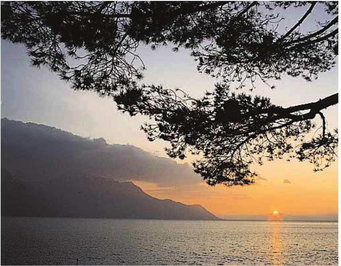
Sunset over Lake Geneva, Switzerland

The young people's week was centred on the question "Can we live with clarity and beauty in the midst of the influences of modern life?". This theme was a reflection of the general concern young people have with the balance between inner qualities and the demanding ways of society, particularly when they come to leaving school and going on to acquire a professional specialization and/or getting a job. The age spectrum of the participants in the dialogues proved to be quite important, since it allowed for a valuable exchange across the different stages at which people found themselves in regard to this question, ranging from young teenagers just starting to think on these things to grown-ups with long personal and career tracks. The sense of communal living at the chalet, all the other activities of the programme and the more per-