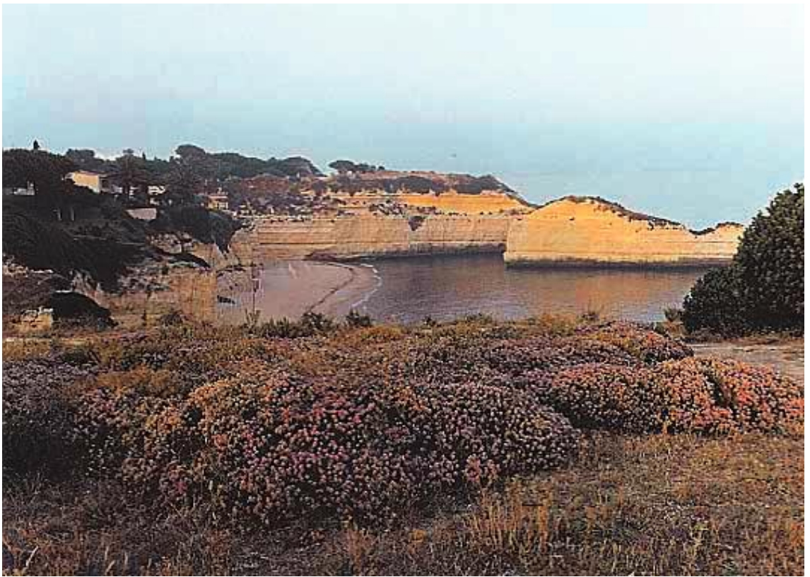
June in the Algarve, Portugal

For us, such an environment is preferably one that is close to natural things, maximizing the opportunity of sensing the natural world and our physical and psychological relationship to it. We have chosen to reduce (not eliminate) our use of modern technologies as a kind of direct attack on cultural conditioning, with the aim of exposing tradition and social morality. Our aim is to expose (not oppose) and by so doing to develop discernment between preferred and actual needs and wants.