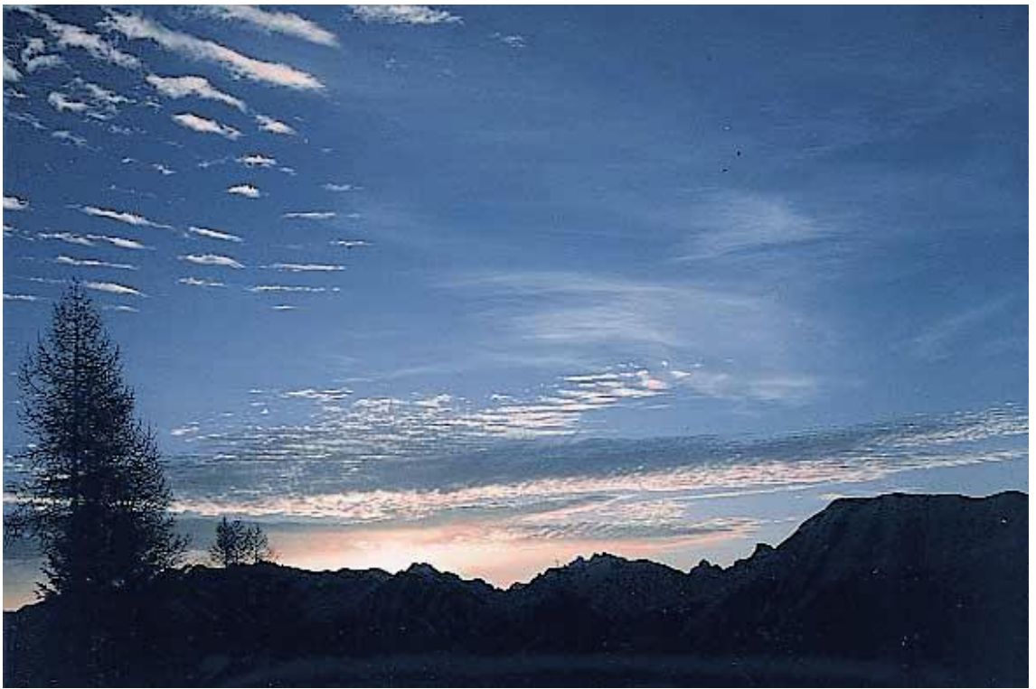
Morning sky at Riederalp, Wallis, Switzerland

– Self-Concern (Cambridge University Press, 1998) – I’ve tried to integrate my own version of some of what I take to be Krishnamurti’s key insights about the self into a theory for which I’ve argued in the standard way. The insights of Krishnamurti that I’ve used, which are only a small part of what he had to say on the topic, have to do with the role of the psychological process of identification in the constitution of the self. So, in my view, some at least of what Krishnamurti had to say is highly relevant to current academic concerns and can be worked up and considered in a standard academic way. How extensively this might be done with Krishnamurti’s views is an open question.