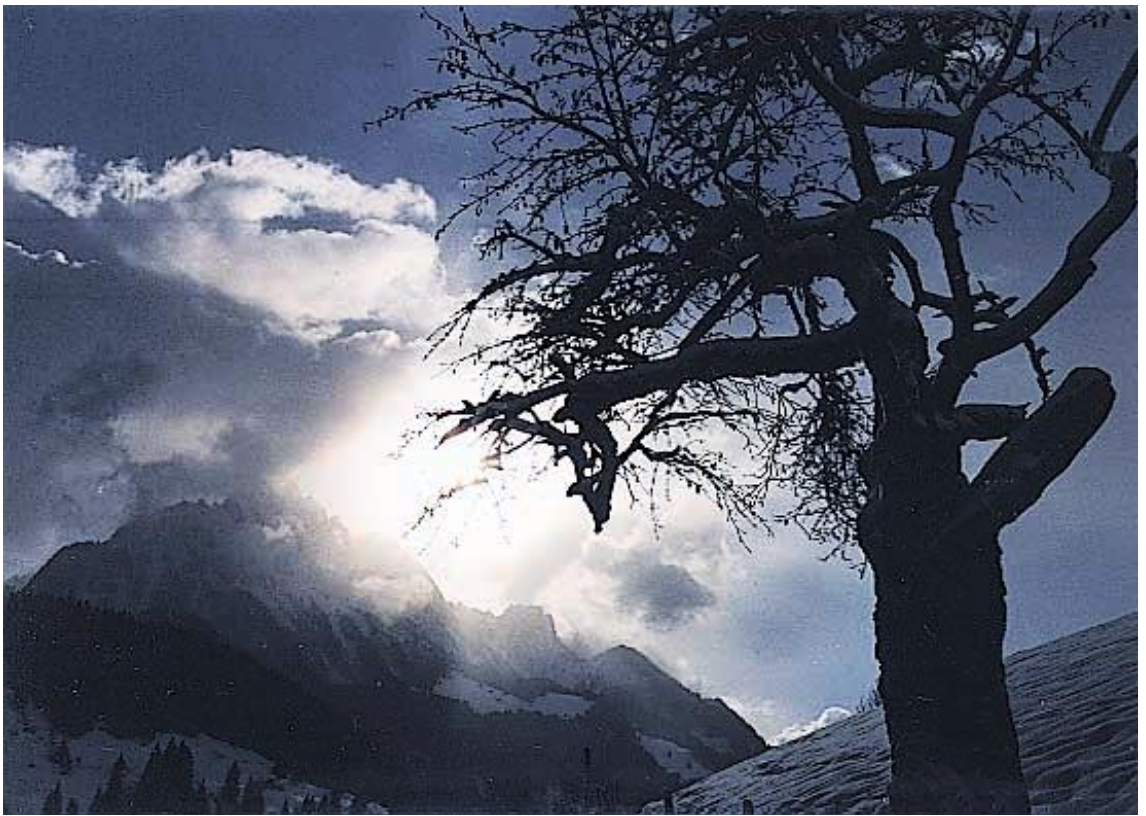
Old cherry tree against the afternoon sun, near Rougemont, Switzerland

I love?’ It remained open at the last page. As the top of the page began mid sentence, I turned to the previous page. The paragraph began: