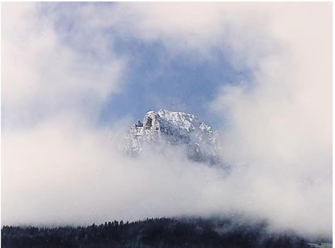
Rübli through clouds, Rougemont, Switzerland

freedom, or felt free, or saw the prison of my conditioning, were not just illusions. The conditioned mind, the mind which did not transform yet, needs faith or confidence that as a human being I have the capacity to understand. If that faith would be absolutely lacking we would feel too threatened to open ourselves to something new.