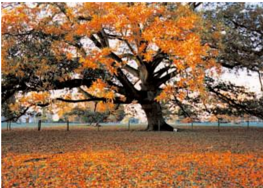
Autumn at Brockwood Park, England