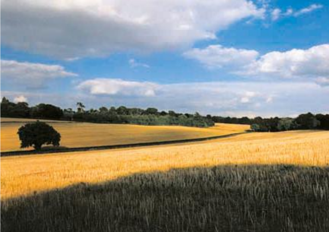
Harvested cornfields near Brockwood Park, England

The material world has many levels of coherent structure, i.e. atomic, molecular, cellular, organic, ecological, global, solar, galactic, and cosmic. The wholeness of the fundamental movement (that can't be reduced to the movement of "parts") reveals and displays itself at each level, so that each level has its own integrity, beauty and meaning. No level is more "important" than another, and neither the cosmic nor atomic levels have prior or essential standing, because the essence no longer lies in the manifest material world and so physical size does not have the significance it had.