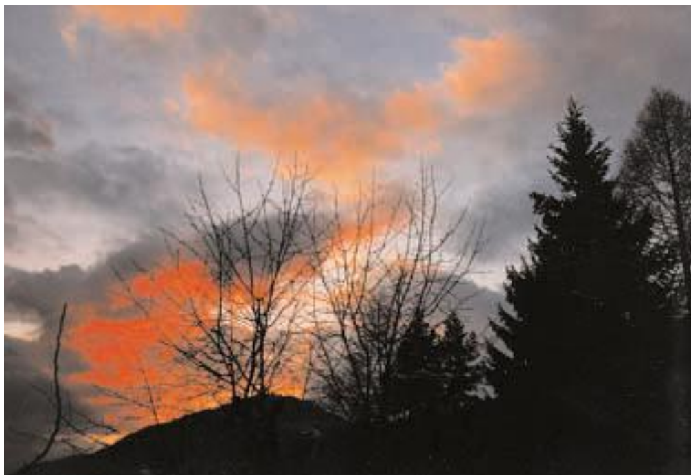
Evening sky, Rougemont, Switzerland

It is like this: One never rejects joy; it is so strong, so vibrant, so alive, so creative that one never questions it, discards it, runs away from it; it consumes one and carries one in its movement. In that moment of great happiness there is no question of wanting to get rid of it, or wanting to find out the cause of joy; one lives in it. Now, in the same way, if I may suggest, do the same thing with sorrow. Naturally, when one escapes from it or one seeks a remedy in the innumerable beliefs, or in people, the fullness or richness of sorrow is diminished; and the man who knows how to suffer greatly with intelligence, not with acceptance or resignation, knows the real ecstasy of living.