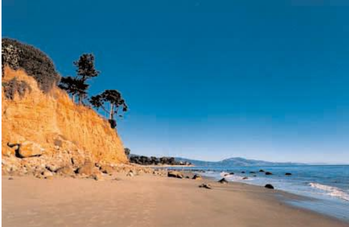
Pacific coast, Santa Barbara, California

wholeness of life, but it applies more specifically to the study centres and to the schools informed by K's holistic approach to education, as this space and time of leisure is at the heart of the very definition of 'school'. For K leisure meant: "A time, a period, when the mind is not occupied with anything whatsoever. It is the time of observation. It is only the unoccupied mind which can observe. A free observation is the movement of learning. This frees the mind from being mechanical."