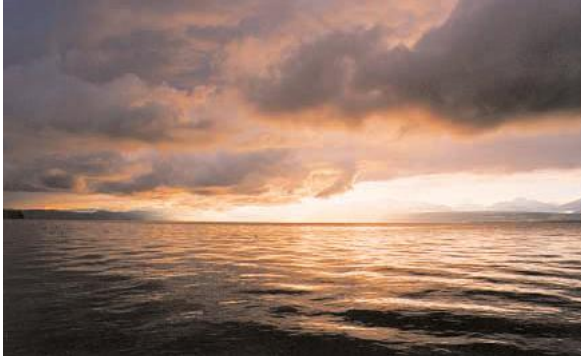
Lake Geneva near Buchillon, Switzerland

is, what truth is? It is, sirs, partly because we do not understand this life in which we are living, because this life is too much, too hectic, too chaotic. So you say, 'If I can understand what truth is, then in that understanding I may perhaps understand this.'