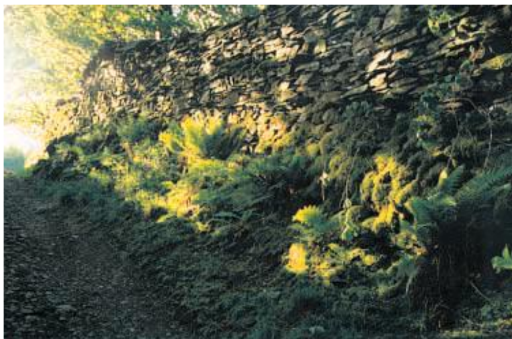
Path at Yewfield, Hawkshead Hill, in the Lake District, England

Krishnamurti's Notebook, pp. 201-02, Copyright 1976 by KFT