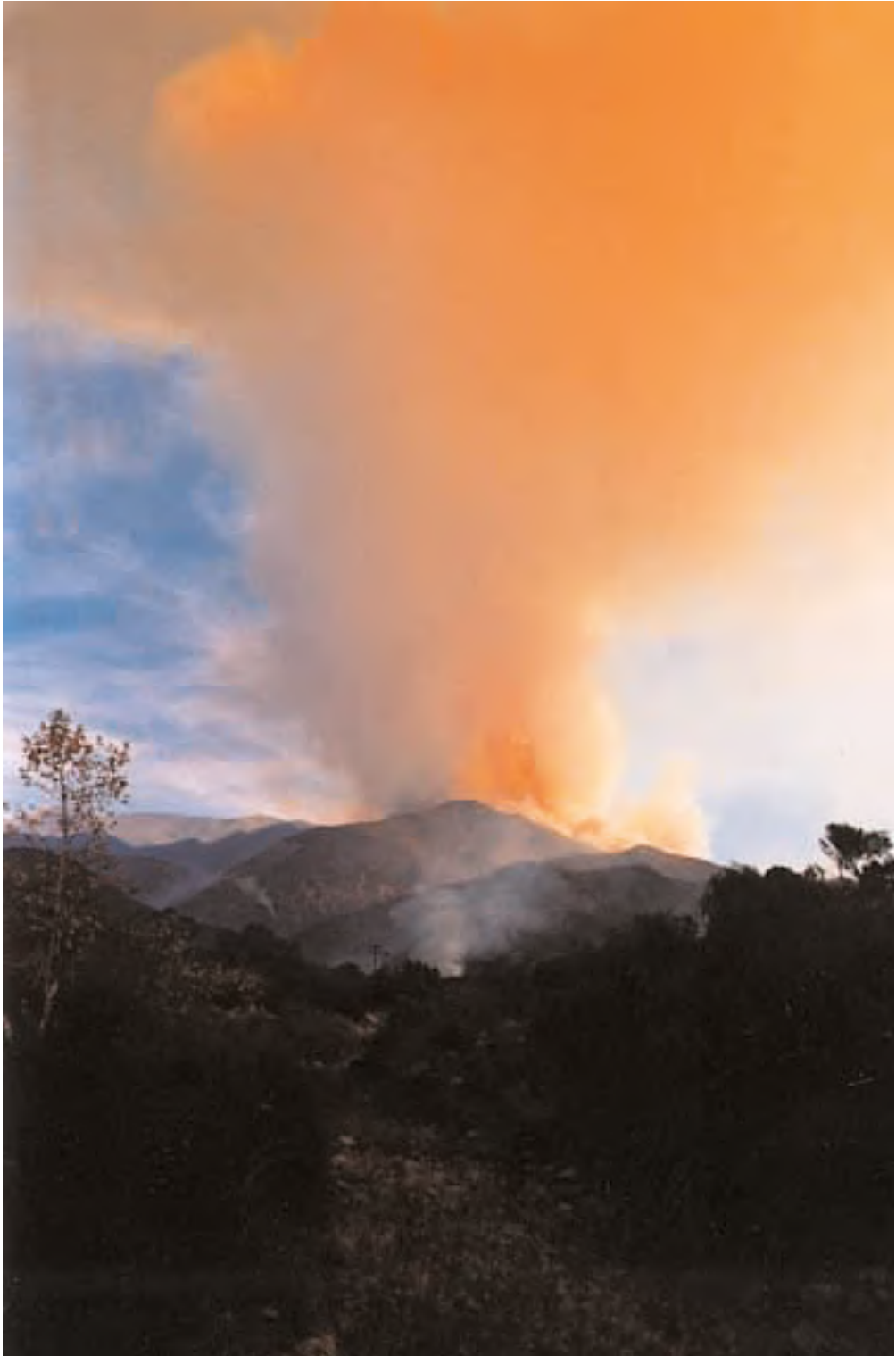
Bush fire in the Ojai Valley, California, December 1999