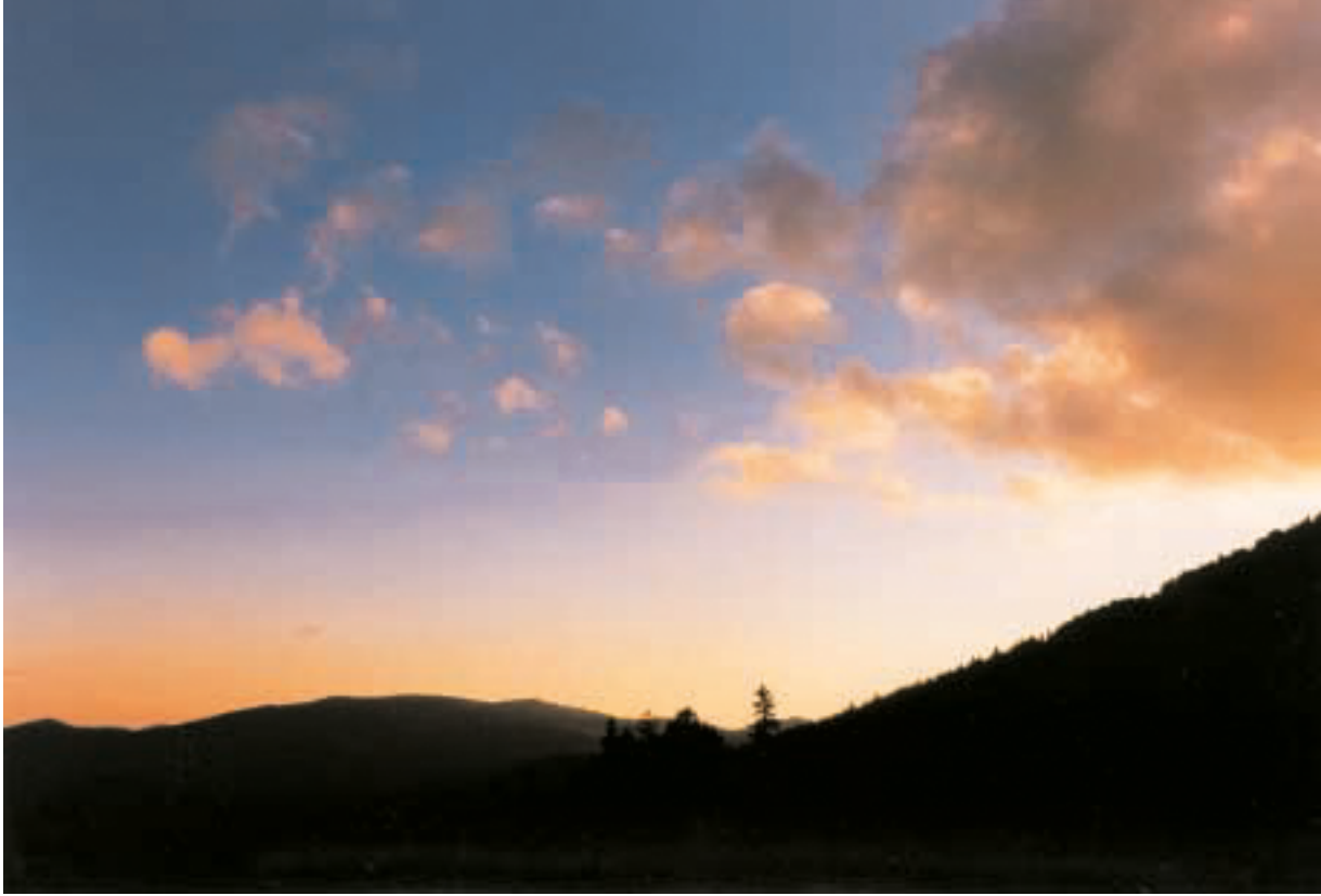
Near Haus Sonne, Black Forest, Germany

Haus Sonne (the vegetarian guesthouse in the Black Forest in Germany) has a library of K books and audio- and videotapes. People who have never heard of the teachings can come upon them there, and an increasing number of people who have already heard about them are turning up. There have been three or four K books published in Germany this year, perhaps accounting for the growing interest. I also met an Italian man and a Croatian man who were visiting Haus Sonne, having heard of it in The Link . Haus Sonne's address may be found on pg. 46. The Link team's first retreat next year will be in June at The Krishnamurti Centre at Brockwood Park.