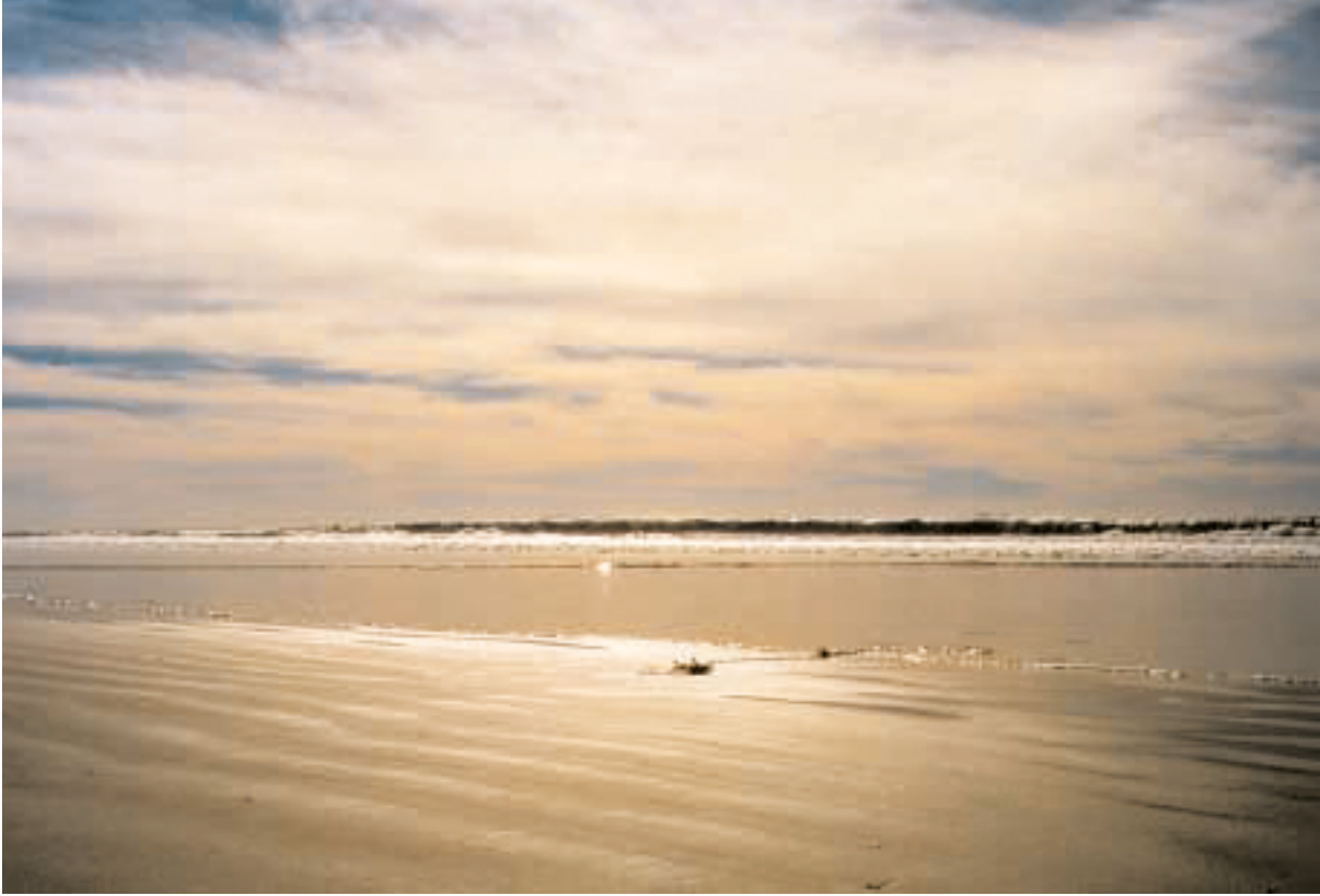
The Pacific coast, San Diego, California, USA

cords whatsoever. Everything seemed in an unchanging and deeply experienced unity. At that point, the bliss I felt overflowed and tears came like offerings of gratitude.