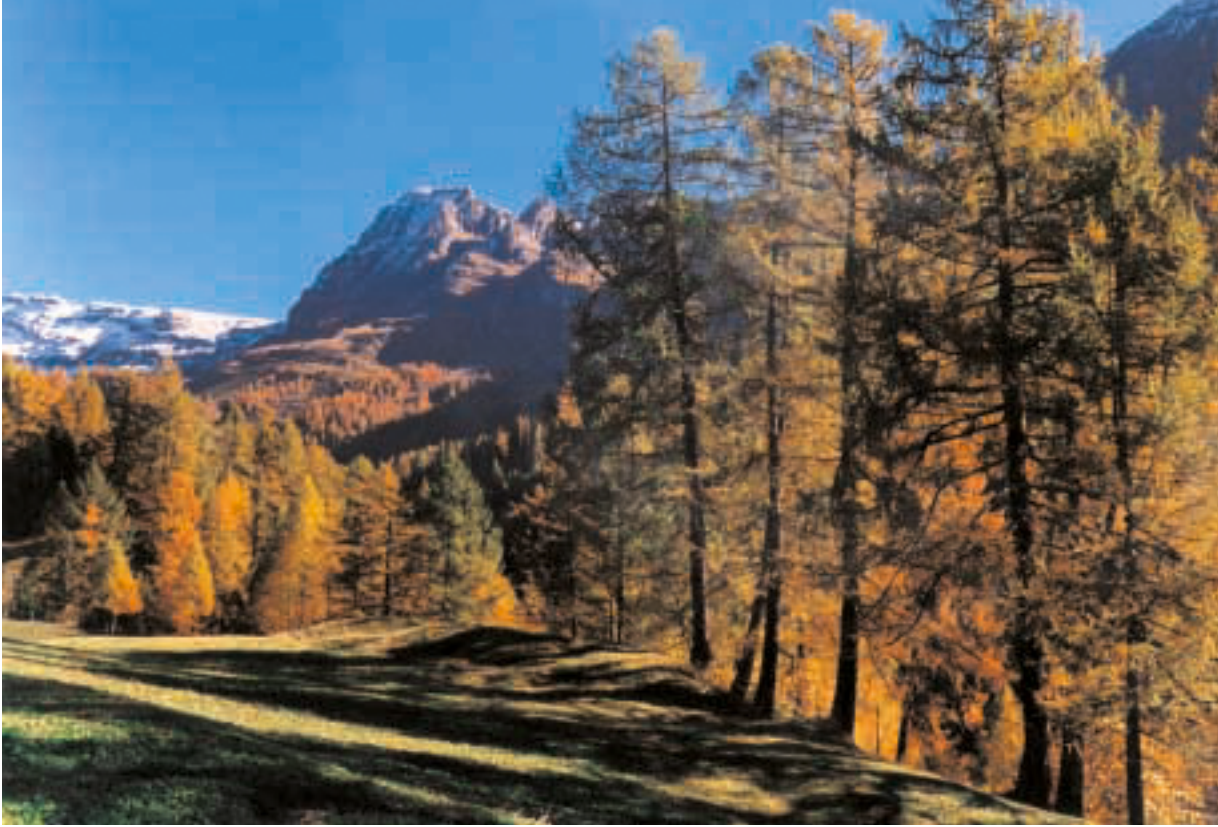
Autumn in Leukerbad, Valais, Switzerland

although slightly different in different cultures and religions (for example, heaven, Brahman, nirvana, etc.) – is without conflict and suffering. Even in K’s teachings, the terms ‘total freedom’, ‘choiceless awareness’ and ‘unconditional love’ can easily become our ideals to pursue. This very act of pursuing creates a division between ‘what we are’ and what we feel ‘we should be’.