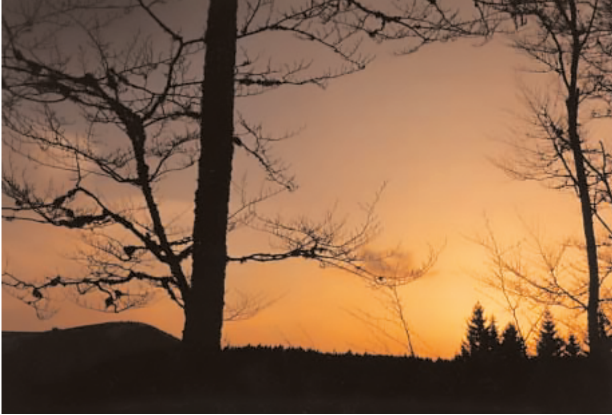
Near Haus Sonne, Black Forest, Germany

dinners had to be cooked, socks found and the house kept clean! I was raising a family, seemingly to cater to a society that was chiefly concerned with a secular self-oriented way of living that could only fragment life further and bring about a great deal of misery. It was an intolerable situation. How could I raise them to see through the mess, to realize the effortless beauty of life? Could I save them from the trauma and confusion that I, along with many others, had been through? I could see that intensity has to come from within. The flowering is within oneself. But could I prepare the ground, provide the opportunities where the inquiry could take place?