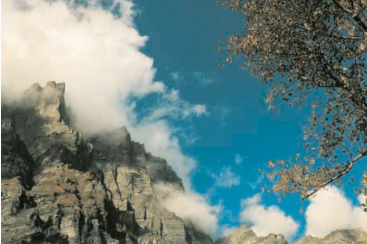
Near Leukerbad, Valais, Switzerland