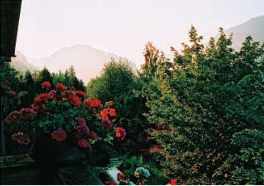
Garden at Chalet Solitude, looking east towards Saanen, Switzerland