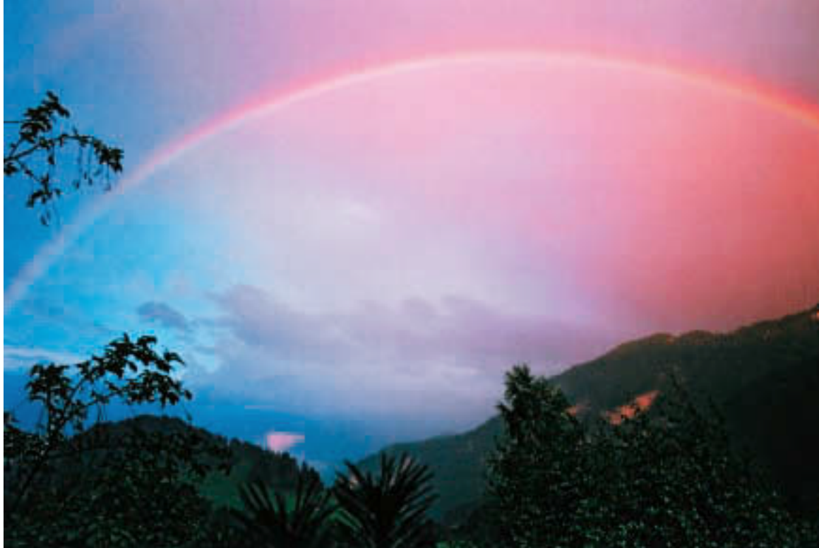
View from Chalet Solitude, Rougemont, Switzerland