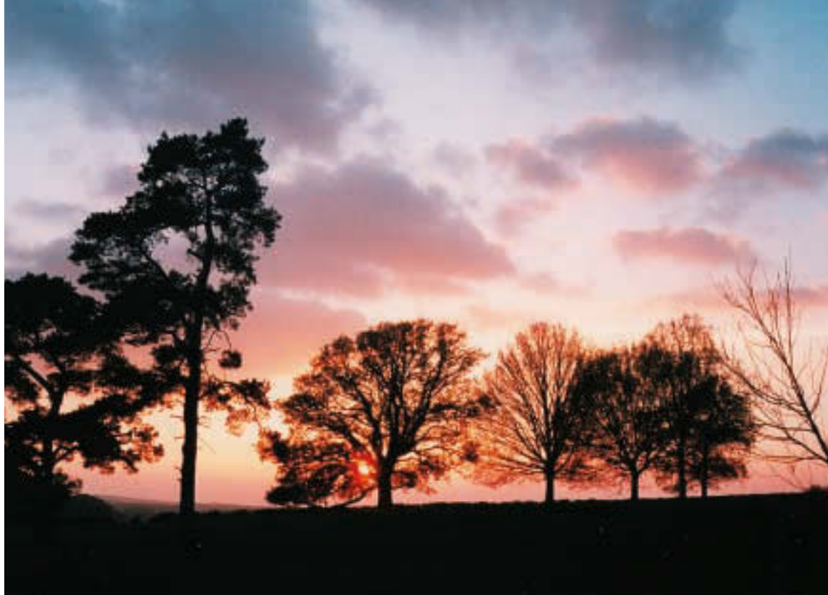
Looking west near the Grove, Brockwood Park, England

others concerned have tried to find the causes so that this general trend could be reversed. We have looked at the animal and found the roots of our inherited aggression there. We have viewed our own psyche as the sophisticated extension of the biological concern with territorial, sexual and hierarchical rights. We have developed 'rational' systems to try to bring some order into the social context of competing self-interests. We have developed complex theories about the nature of consciousness to try to bring some sanity into the sphere of its own internally disjointed organization. We have appealed to tolerance, charity and non-violence. We have preached the gospel of love and tried to kindle the lights of reason and intelligence in order to bring about an enduring sense of peace, with its freedom and responsi-