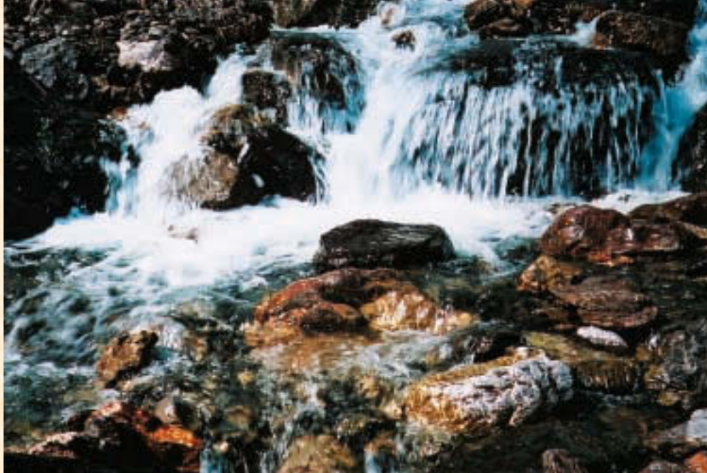
Mountain stream, near Oldenhorn, Switzerland

Say for instance I have a conditioning; you can point it out a dozen times, argue, show the fallacy of it, the stupidity – but I still go on. I resist, I say what it should be, what shall I do in this world otherwise, and all the rest of it. But you see the truth, that as long as the mind is conditioned there must be conflict. So you penetrate or push aside my resistance and get to that, get the unconscious to listen to you, because the unconscious is much more subtle, much quicker. It may be frightened, but it sees the danger of fear much quicker than the conscious mind does. As when I was walking in California high in the mountains: I was looking at birds and trees and watching, and I heard a rattler and I jumped. It was the unconscious that made the body jump; I saw the rattler when I jumped, it was two or three feet away, it could have struck me very easily. If the conscious brain had been operating it would have taken several seconds.