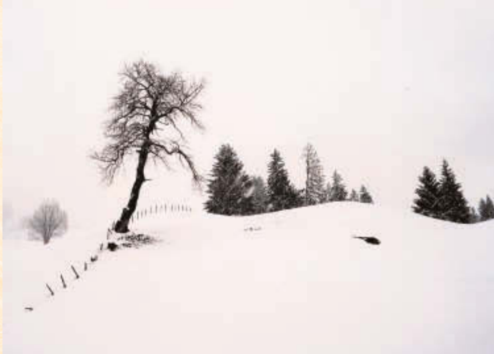
Old cherry tree, near Lauenen and Gstaad, Switzerland

KRISHNAMURTI: But once you have the feeling of this immensity, life has a different colouration, it has a different quality.