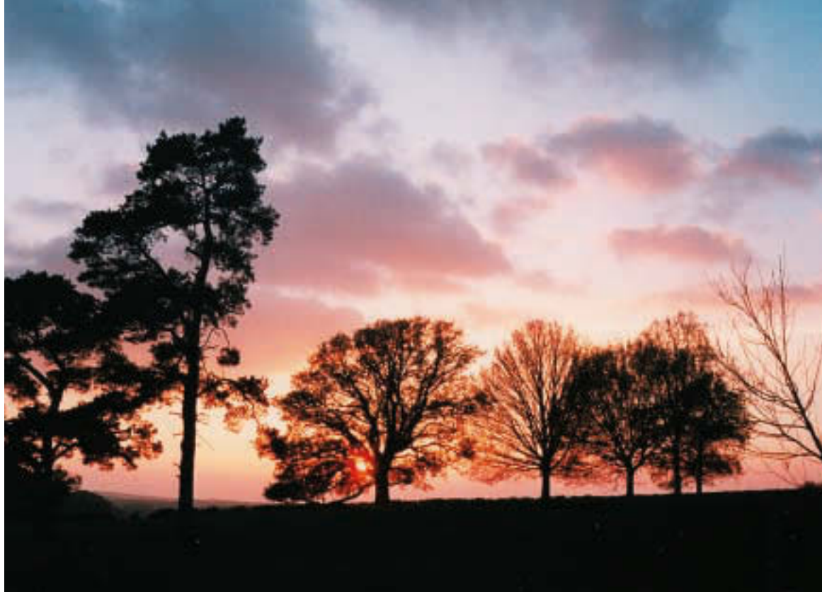
Looking west near the Grove, Brockwood Park, England

others concerned have tried to find the causes so that this general trend could be reversed. We have looked at the animal and found the roots of our inherited aggression there. We have viewed our own psyche as the sophisticated extension of the biological concern with territorial, sexual and hierarchical rights. We have developed 'rational' systems to try to bring some order into the social context of competing self-interests. We have developed complex theories about the nature of consciousness to try to bring some sanity into the sphere of its own internally disjointed organization. We have appealed to tolerance, charity and non-violence. We have preached the gospel of love and tried to kindle the lights of reason and intelligence in order to bring about an enduring sense of peace, with its freedom and responsi-