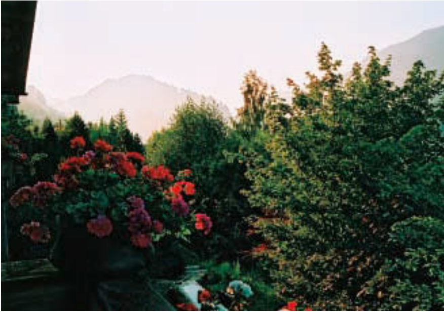
Garden at Chalet Solitude, looking east towards Saanen, Switzerland