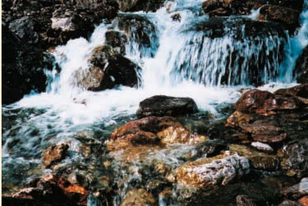
Mountain stream, near Oldenhorn, Switzerland

Say for instance I have a conditioning; you can point it out a dozen times, argue, show the fallacy of it, the stupidity – but I still go on. I resist, I say what it should be, what shall I do in this world otherwise, and all the rest of it. But you see the truth, that as long as the mind is conditioned there must be conflict. So you penetrate or push aside my resistance and get to that, get the unconscious to listen to you, because the unconscious is much more subtle, much quicker. It may be frightened, but it sees the danger of fear much quicker than the conscious mind does. As when I was walking in California high in the mountains: I was looking at birds and trees and watching, and I heard a rattler and I jumped. It was the unconscious that made the body jump; I saw the rattler when I jumped, it was two or three feet away, it could have struck me very easily. If the conscious brain had been operating it would have taken several seconds.