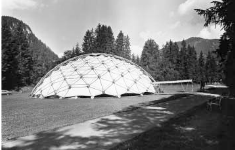
Early conference tent at Saanen, Switzerland, designed by Buckminster Fuller

why some of them left – but all members of this group say that they remain devoted to the teachings. Some are doing work away from Brockwood which they feel is significant to the spreading of the teachings – but they do not feel able to come back and work here on a regular basis. This is true not only of them but of many others. Even our former students, despite their often glowing appreciations of the School, rarely support Brockwood financially as their incomes increase, and very few indeed come back to work here.