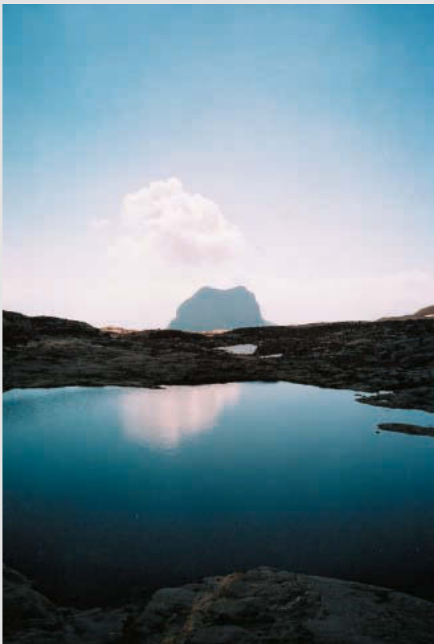
Looking south near the Diablerets Glacier, Switzerland